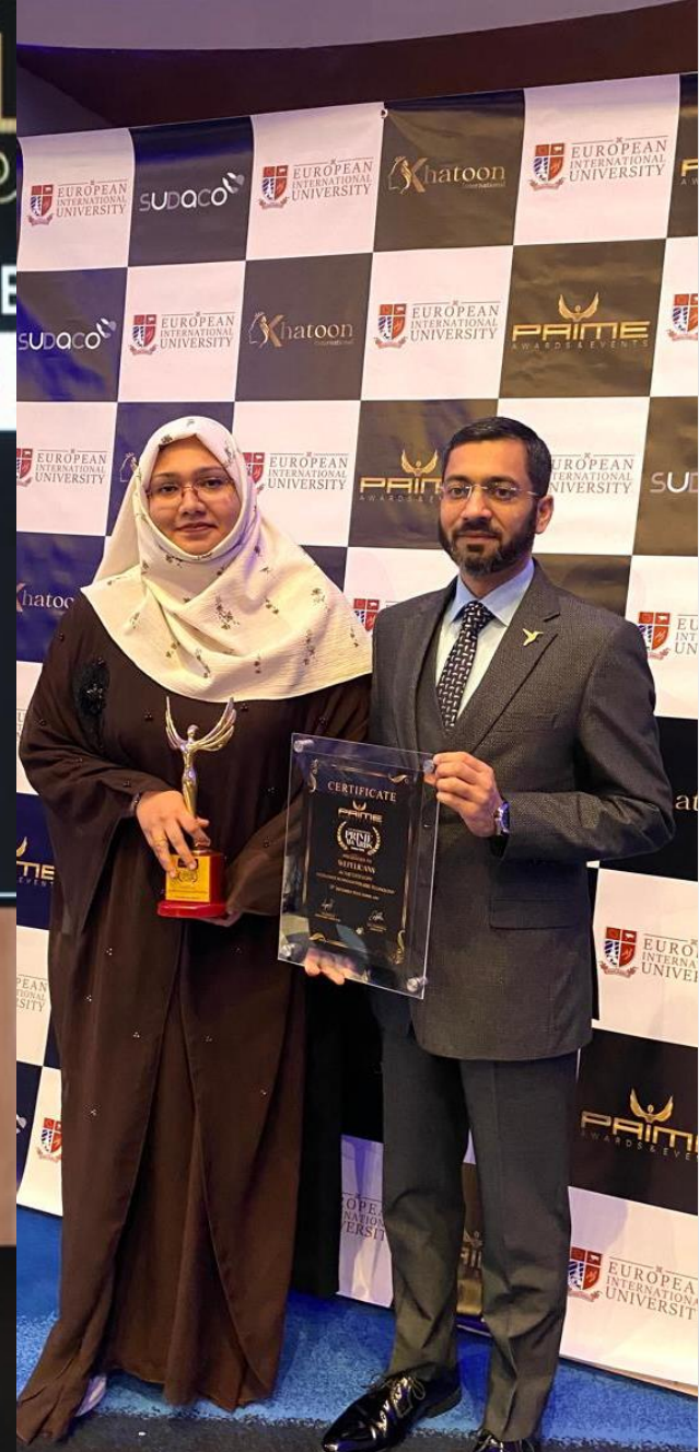
MD of WePelicans received International Prime Awards (Dec 2022)