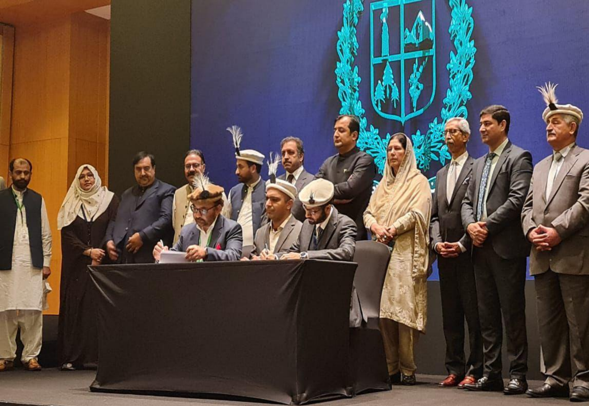
Signing Ceremony with GB Govt. for Mining & Minerals Sector Investments (Feb 2022)