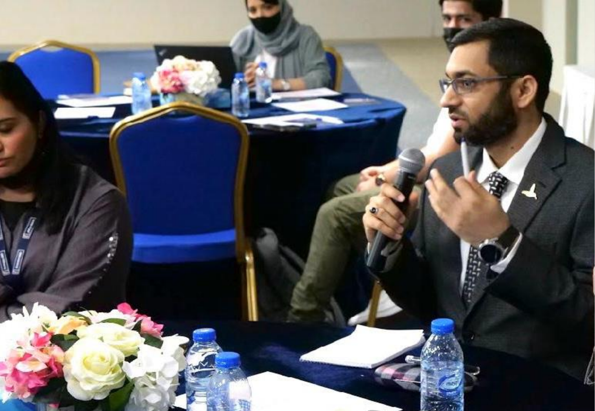
Industry Advisory Committee Meeting at HCT Dubai (2022)