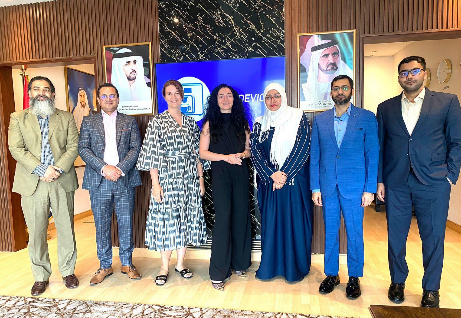
Meeting with Paris based Walton Partners in Dubai (May 2023)