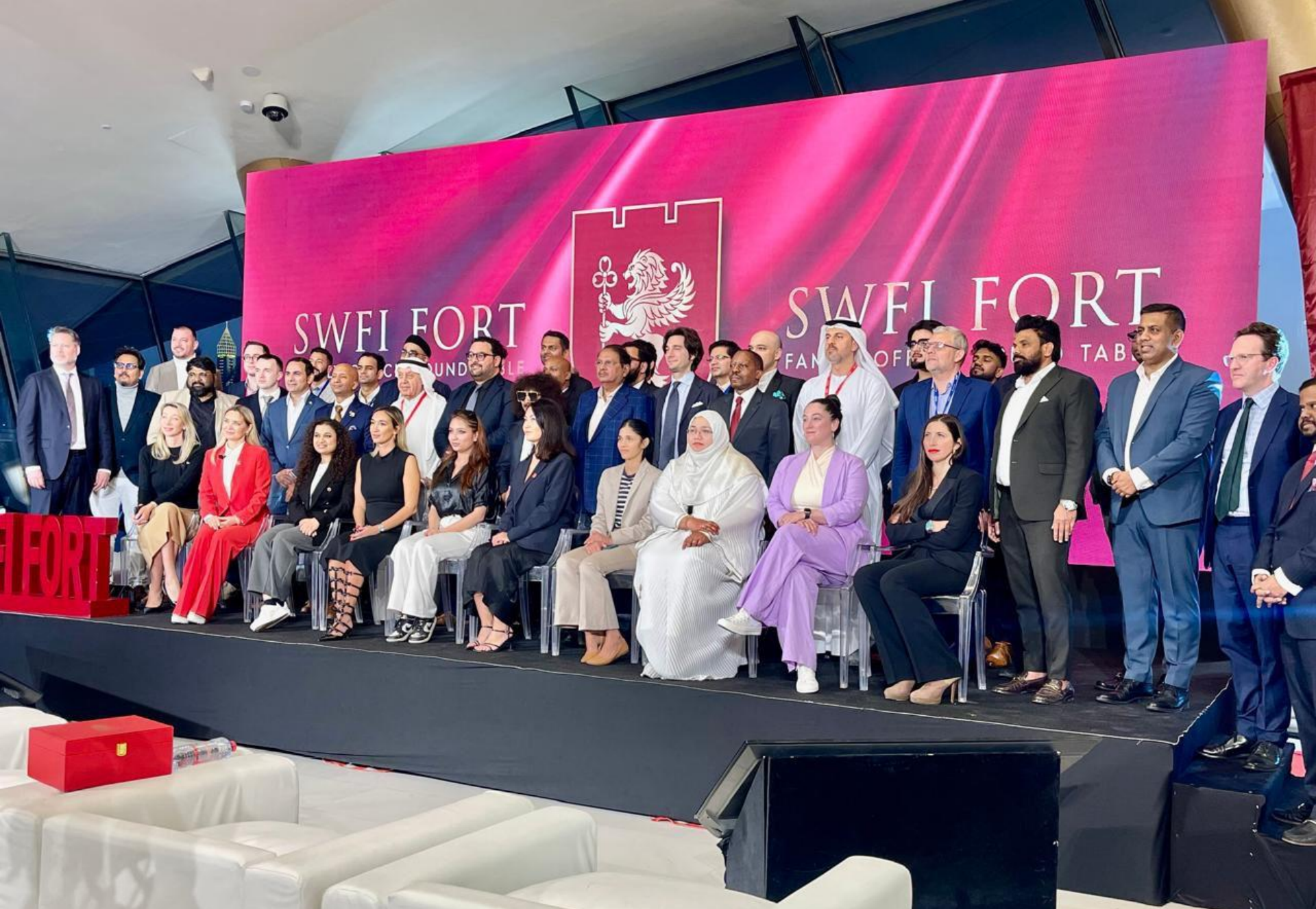
WePelicans Participation in the Sovereign Wealth Fund Institute Fort (Jan 2025)