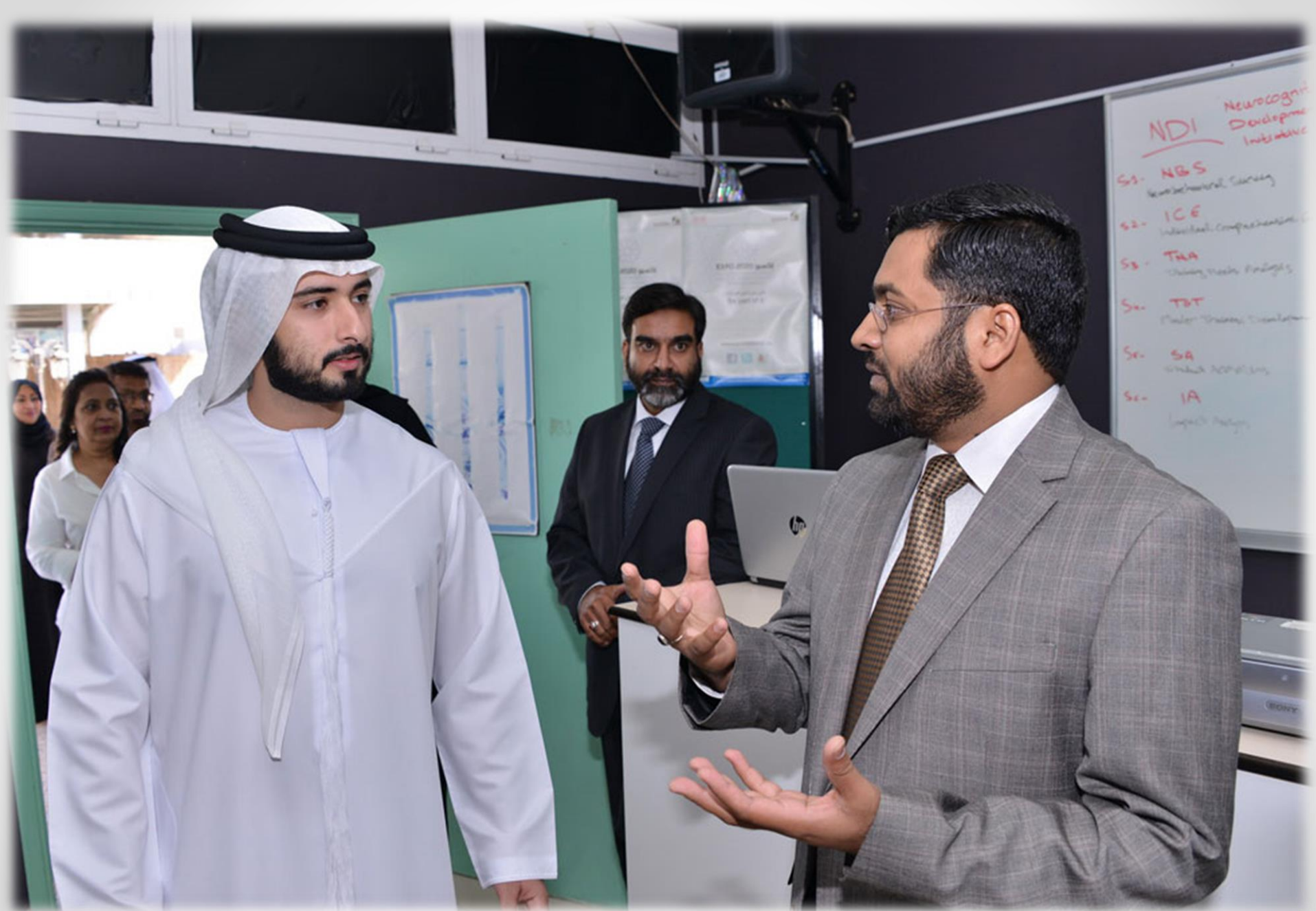
HH Sheikh Majid bin Mohammed Al Maktoum visits Zeal Quest NDI Session – Dubai (2015)