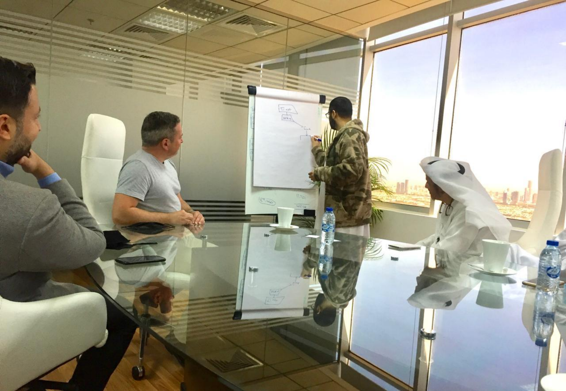
Knowledge Economy Corporate Structuring Workshops in Dubai (2022-23)