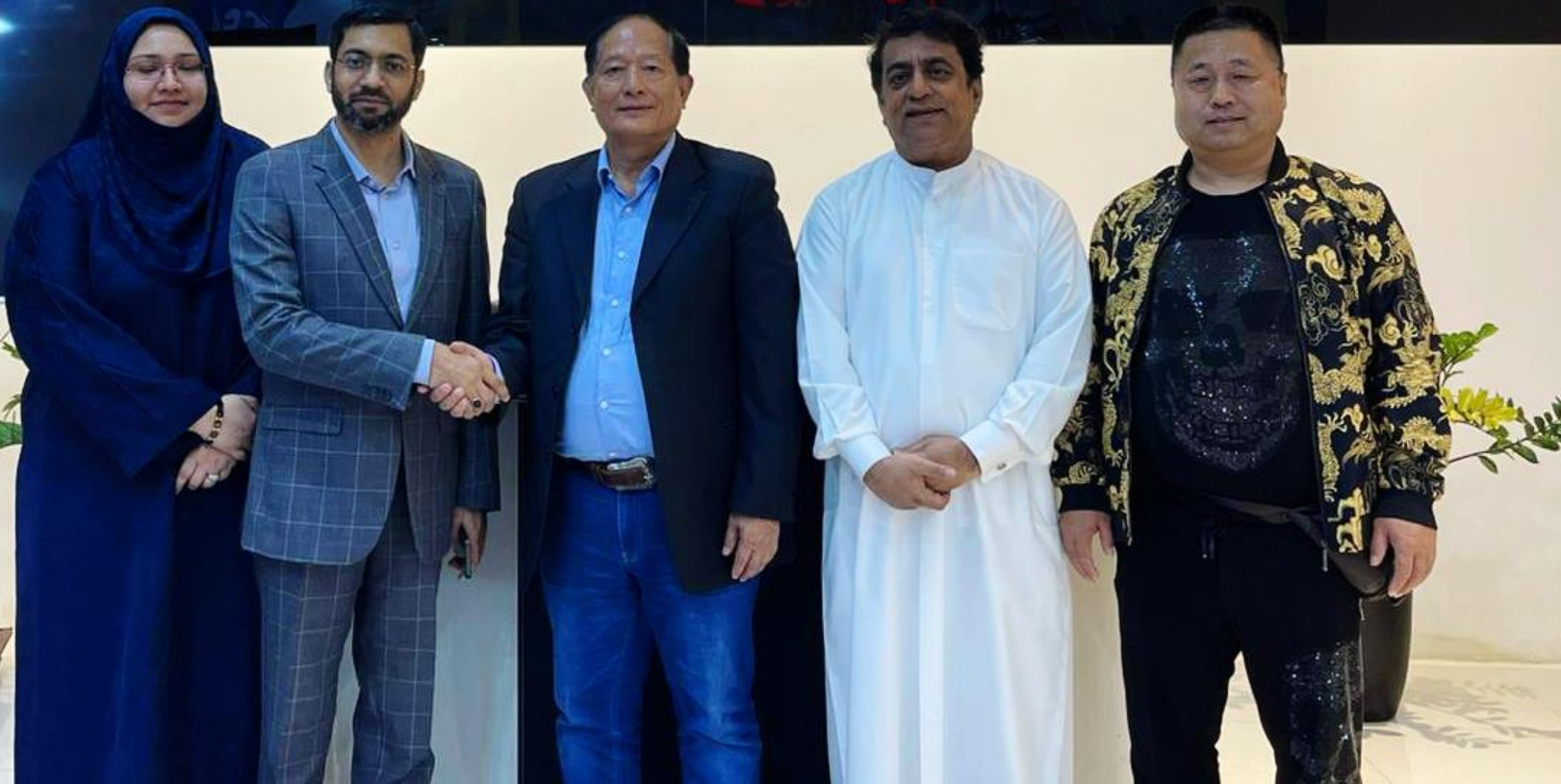
Focused Meeting with Chairman of CDCA in Dubai (Jan 2024)