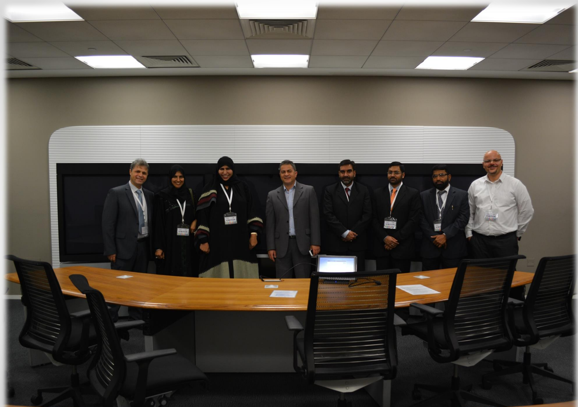
Introducing Neuro-efficiency Trainings to CISCO Networking Academy – Dubai (2015-16)