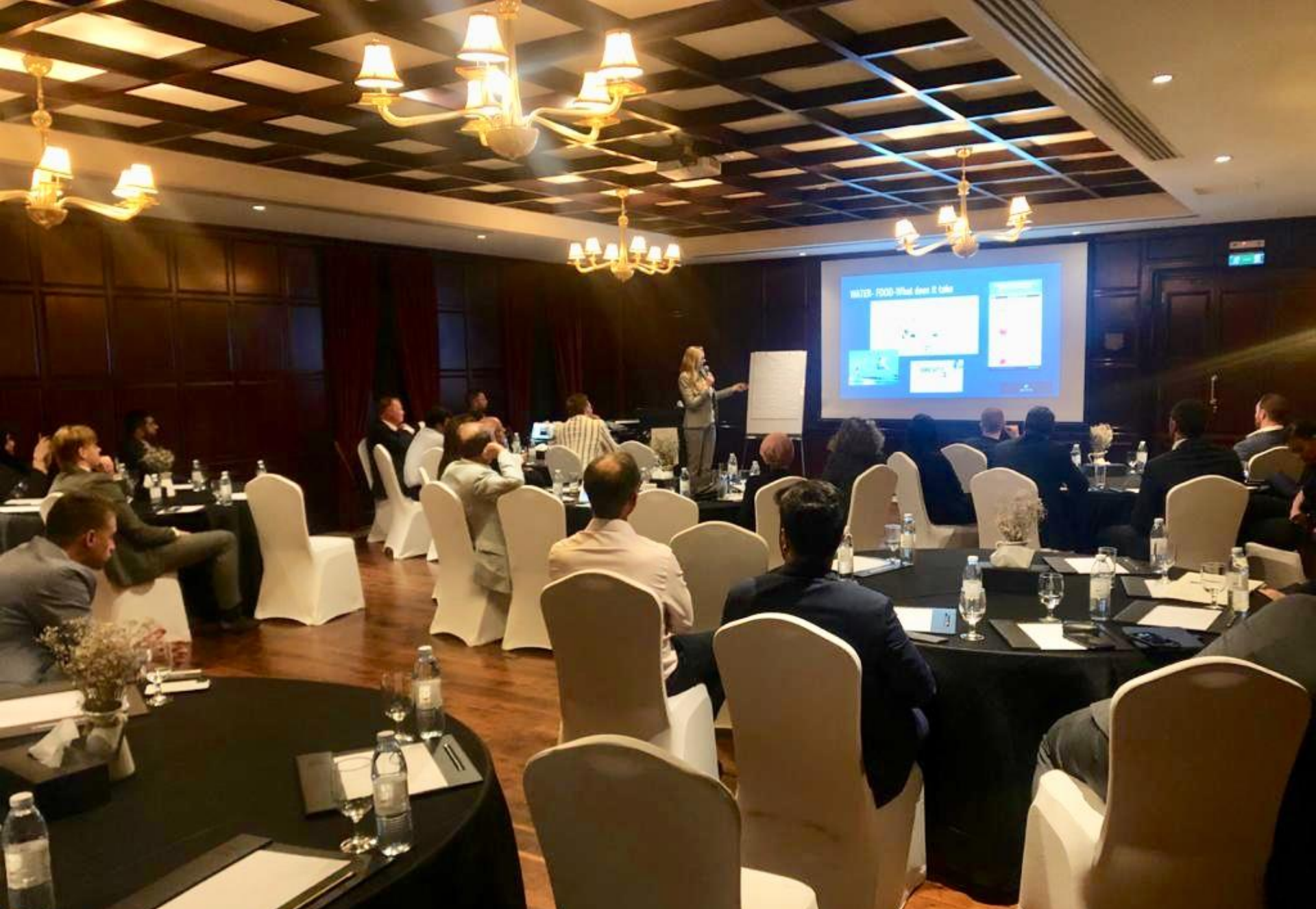
Promoting Impact Investments – Capital for Good (Feb 2020)