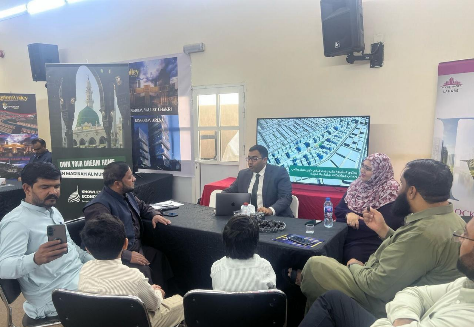
Promoting Saudi Arabian Real-Estate at Global Property Expo in Sharjah (April 2025)