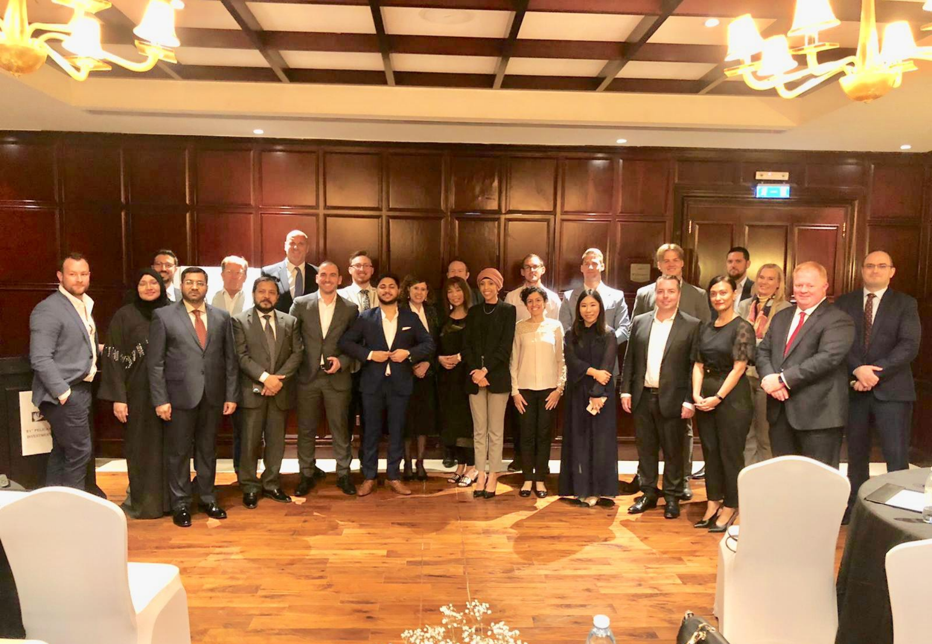
21 st Pelicans Lounge Investment Meeting focused on Impact Investing (Feb 2020)