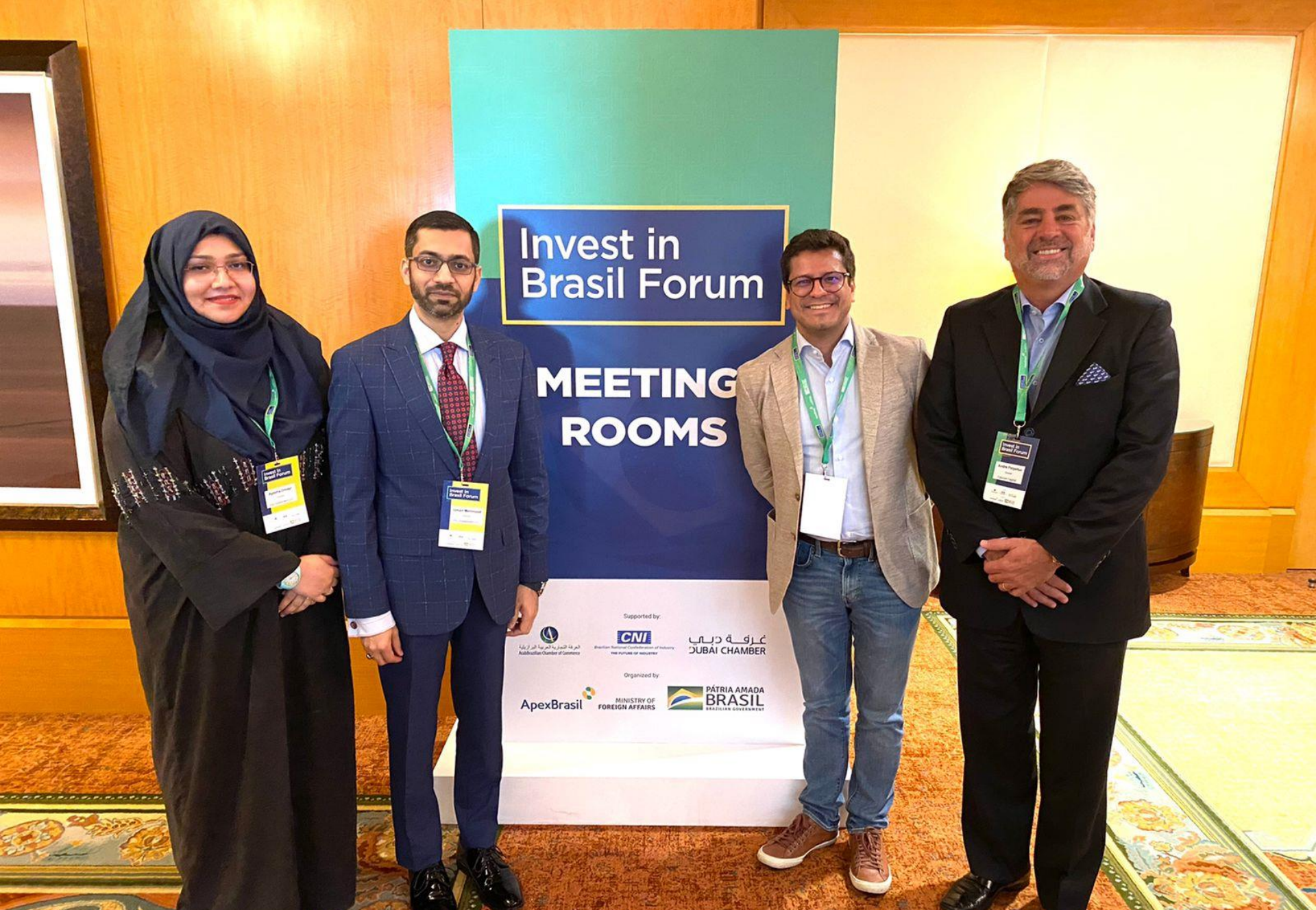
Invest in Brasil Forum (Nov 2021)