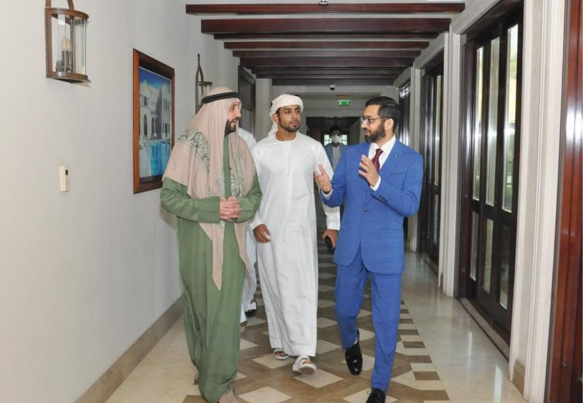
Receiving honorable guests at Dubai Polo & Equestrian Club (Dec 2021)