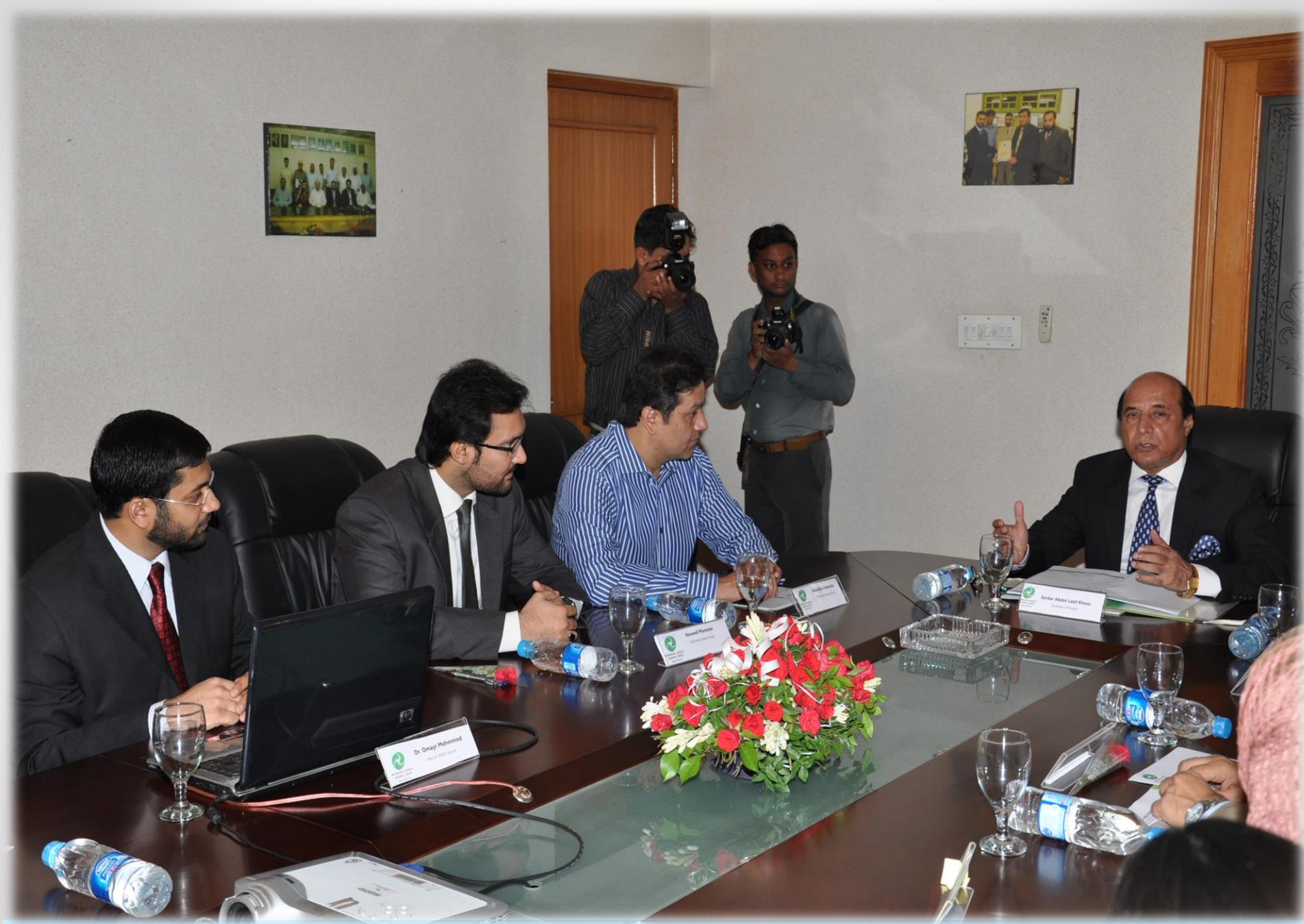
Governor Inaugurates BSRC Trainings Wing at Behavioral Sciences Research Center (2012)