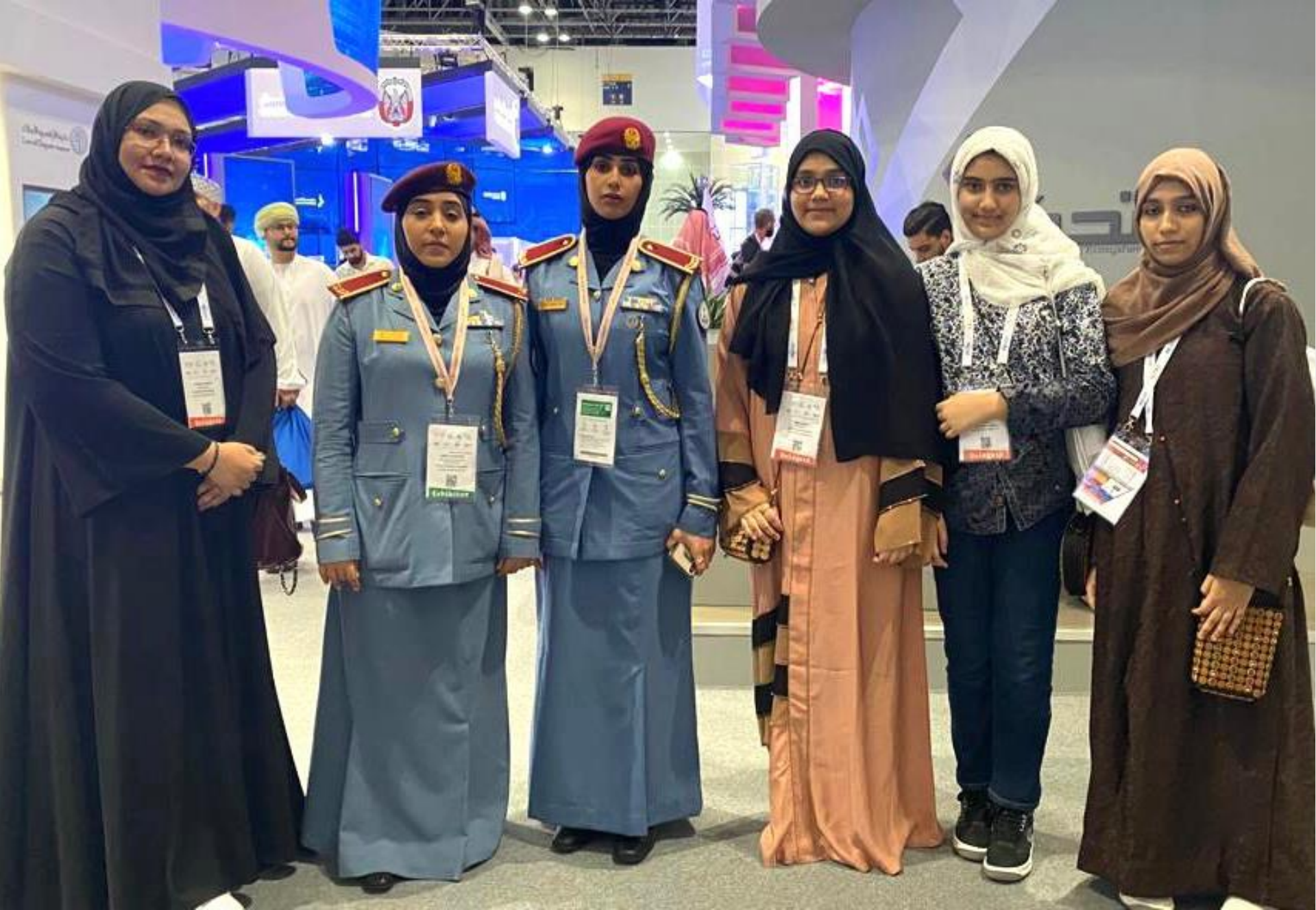
WePelicans participate in GITEX (Oct 2022)