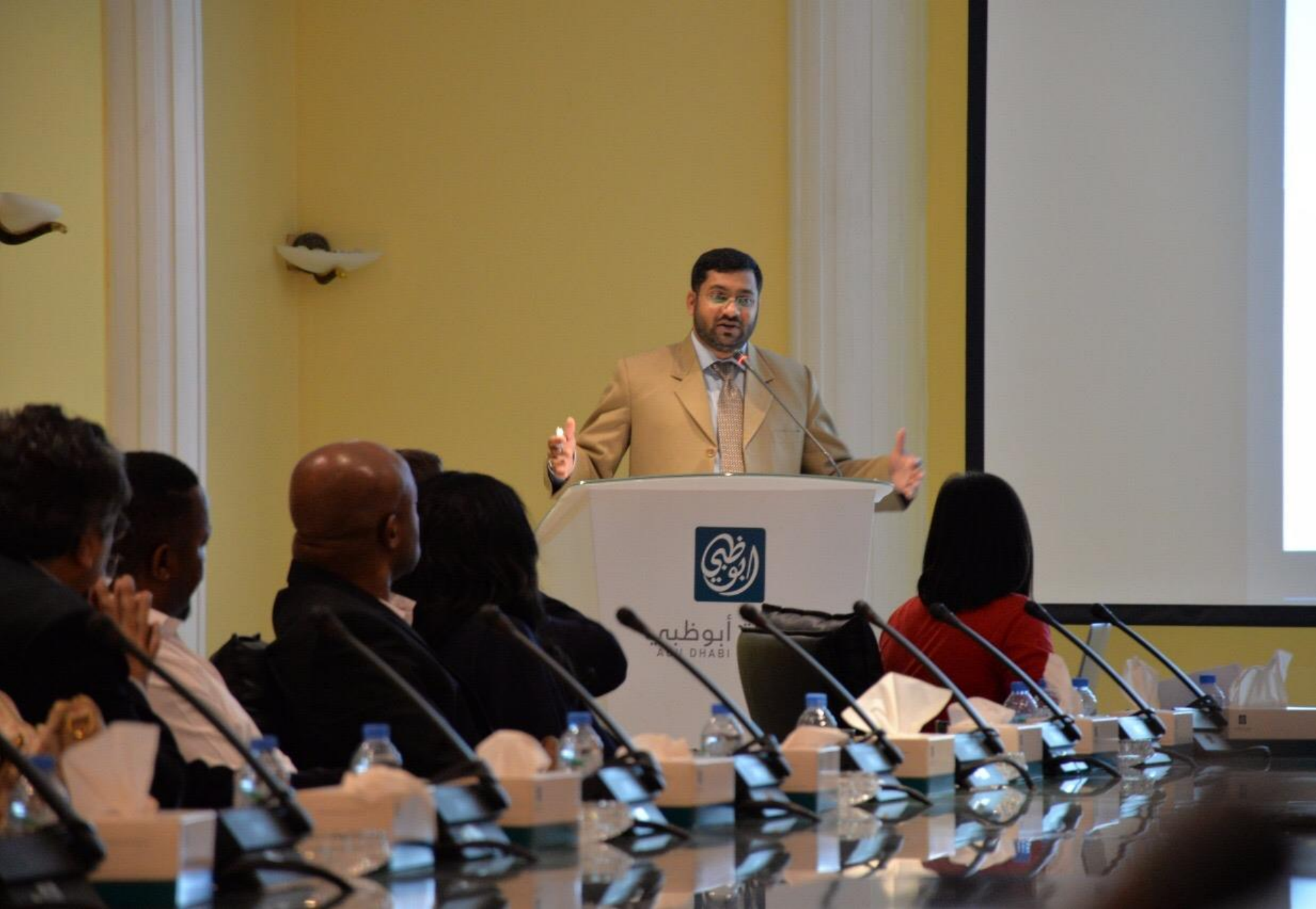
Introducing Cognitive Era in Nanoscale Strategic Investments – Abu Dhabi Chamber (2017-18)