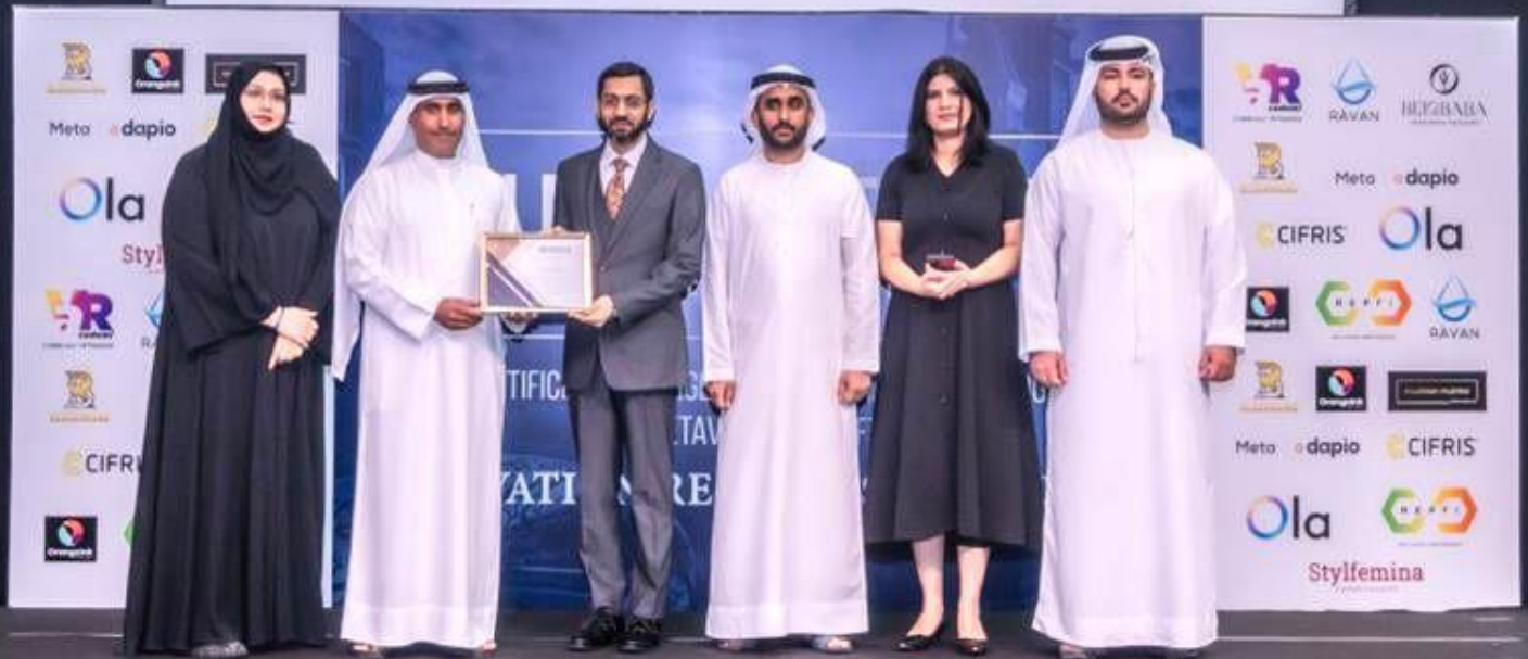
WePelicans honored by Award at the Innovation in Business Summit (Oct 2022)