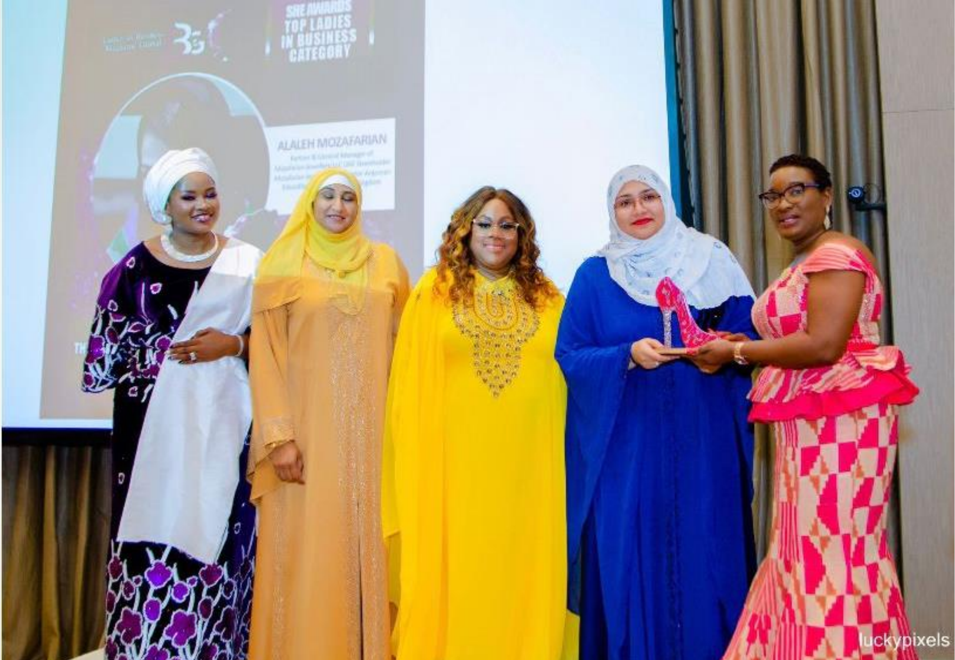
MD WePelicans honored with SHE Awards (March 2022)