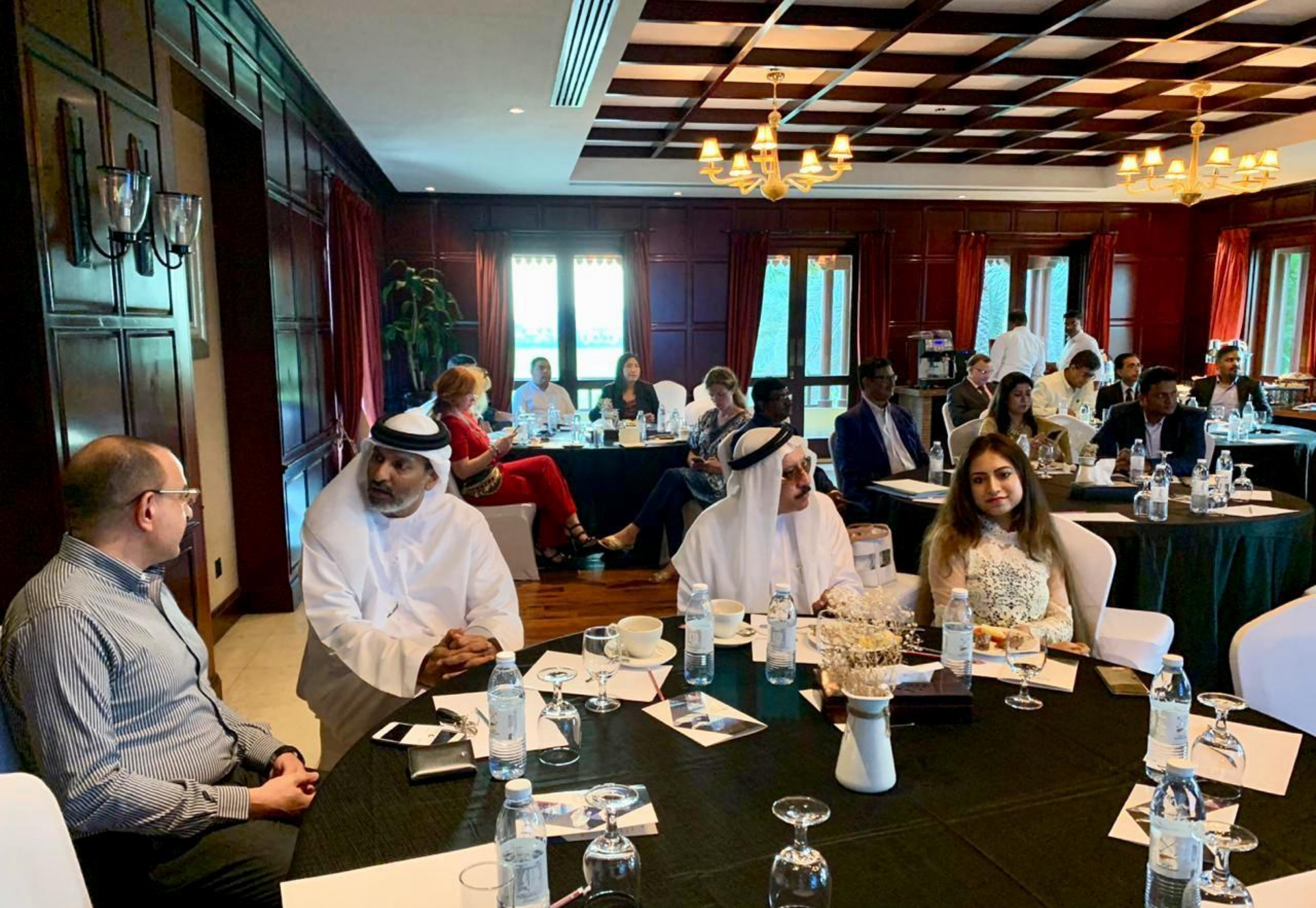
Pelicans Lounge Investment Meetings (2018-25)