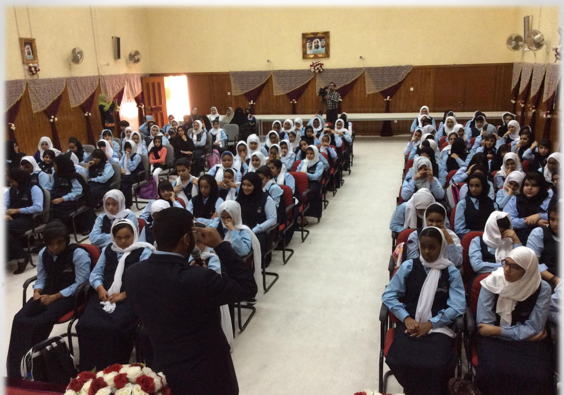
NDI supported by HH Shiekh Majid bin Mohamed Learning Center Dubai (2014-15)