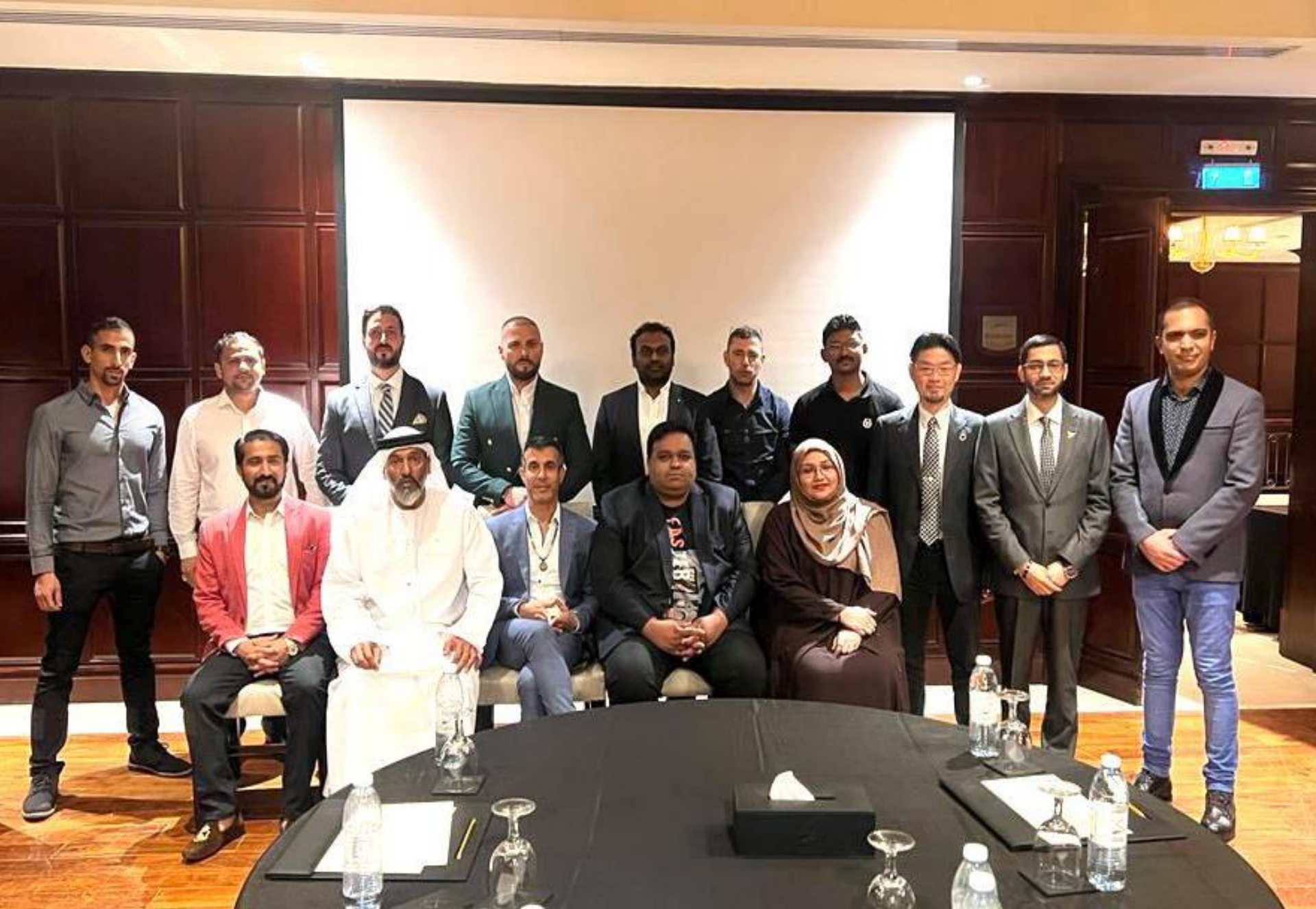
29 th Pelicans Lounge Investment Meeting (March 2022)