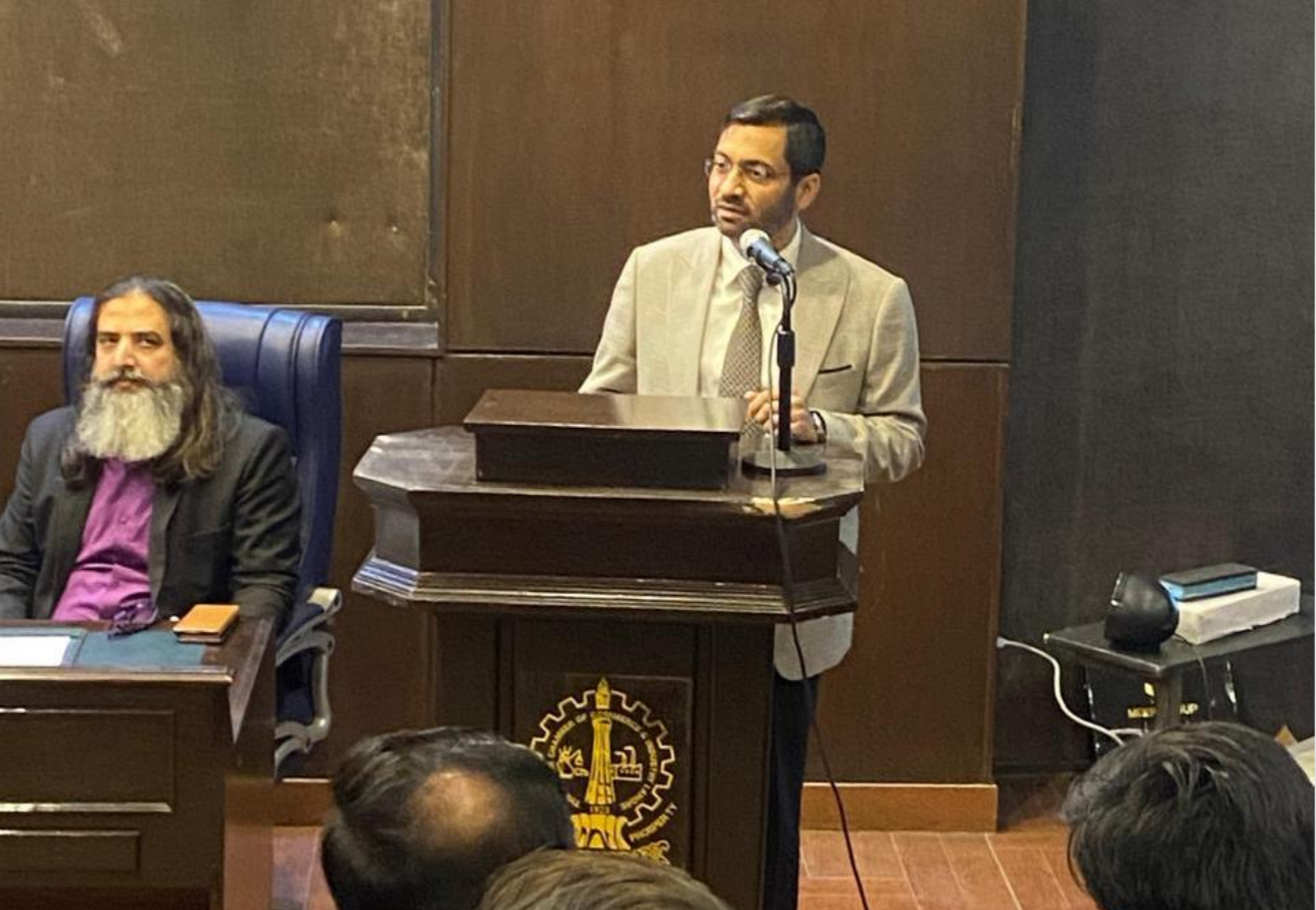
Keynote Speech at Lahore Chamber of Commerce & Industries (March 2024)