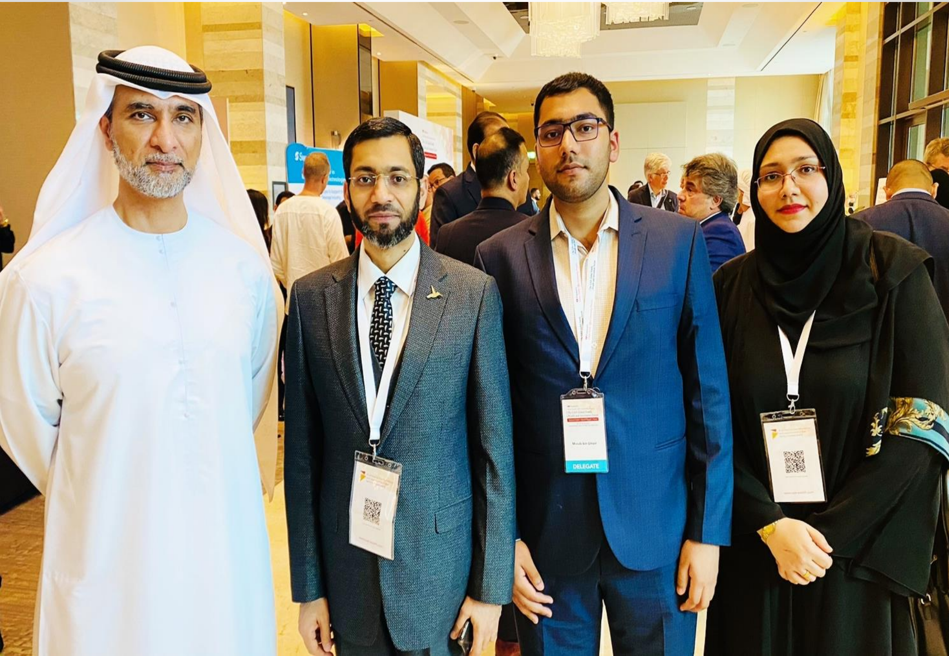
DC Finance Summit in Dubai (Jan 2023)