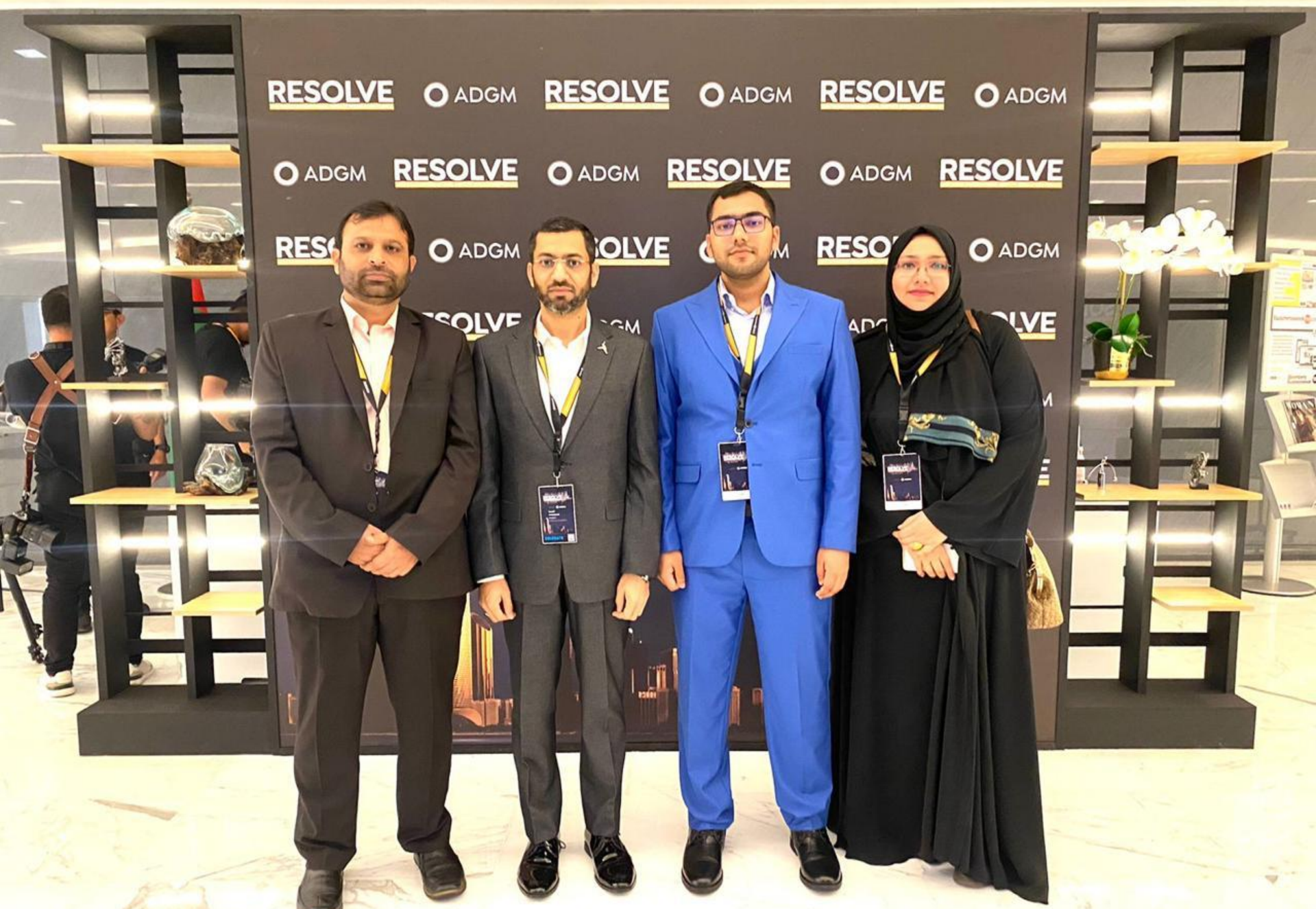
Abu Dhabi Finance Week (March 2023)