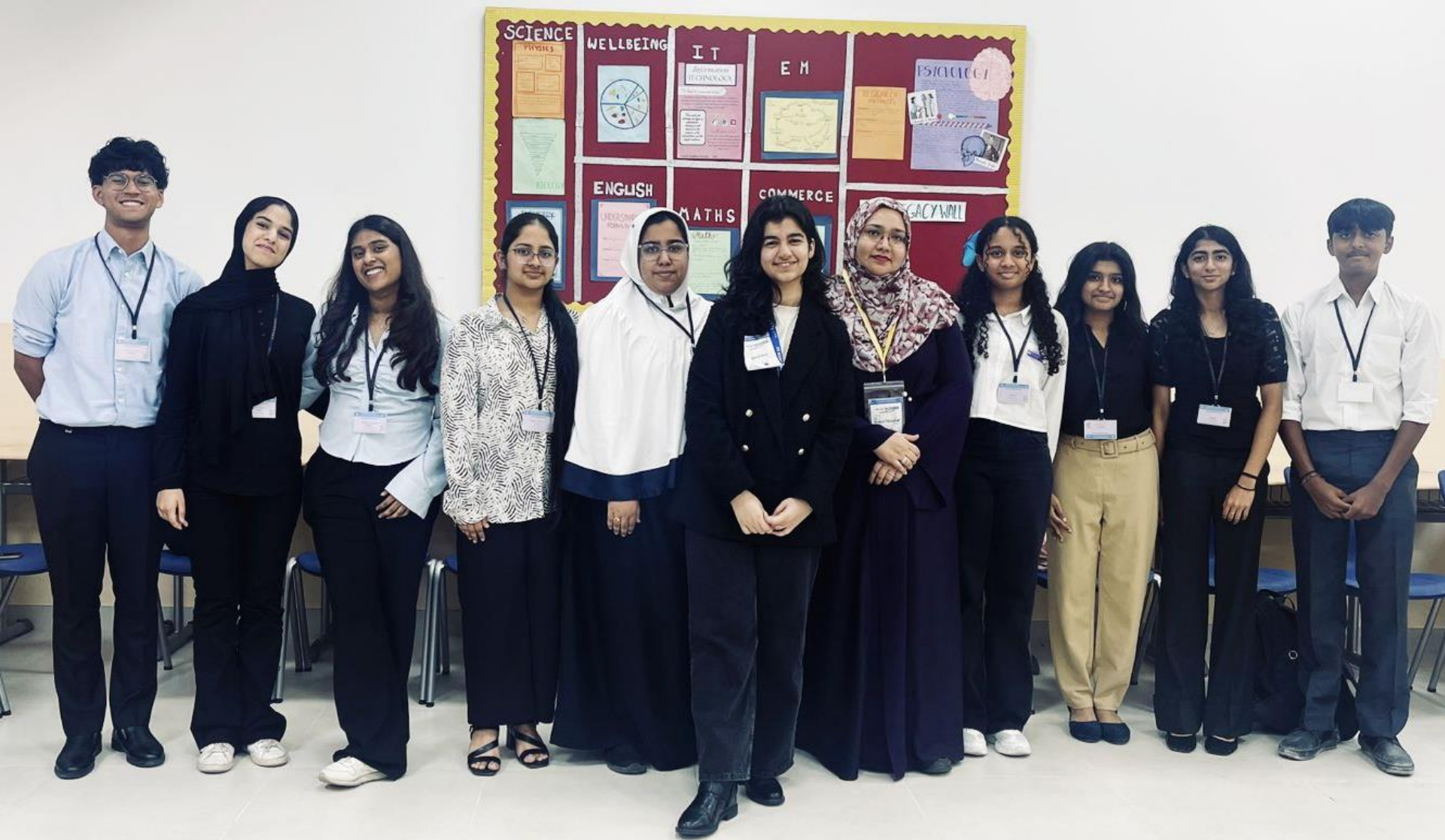
MD WePelicans honored at Girls-up Summit in Dubai (Jan 2025)