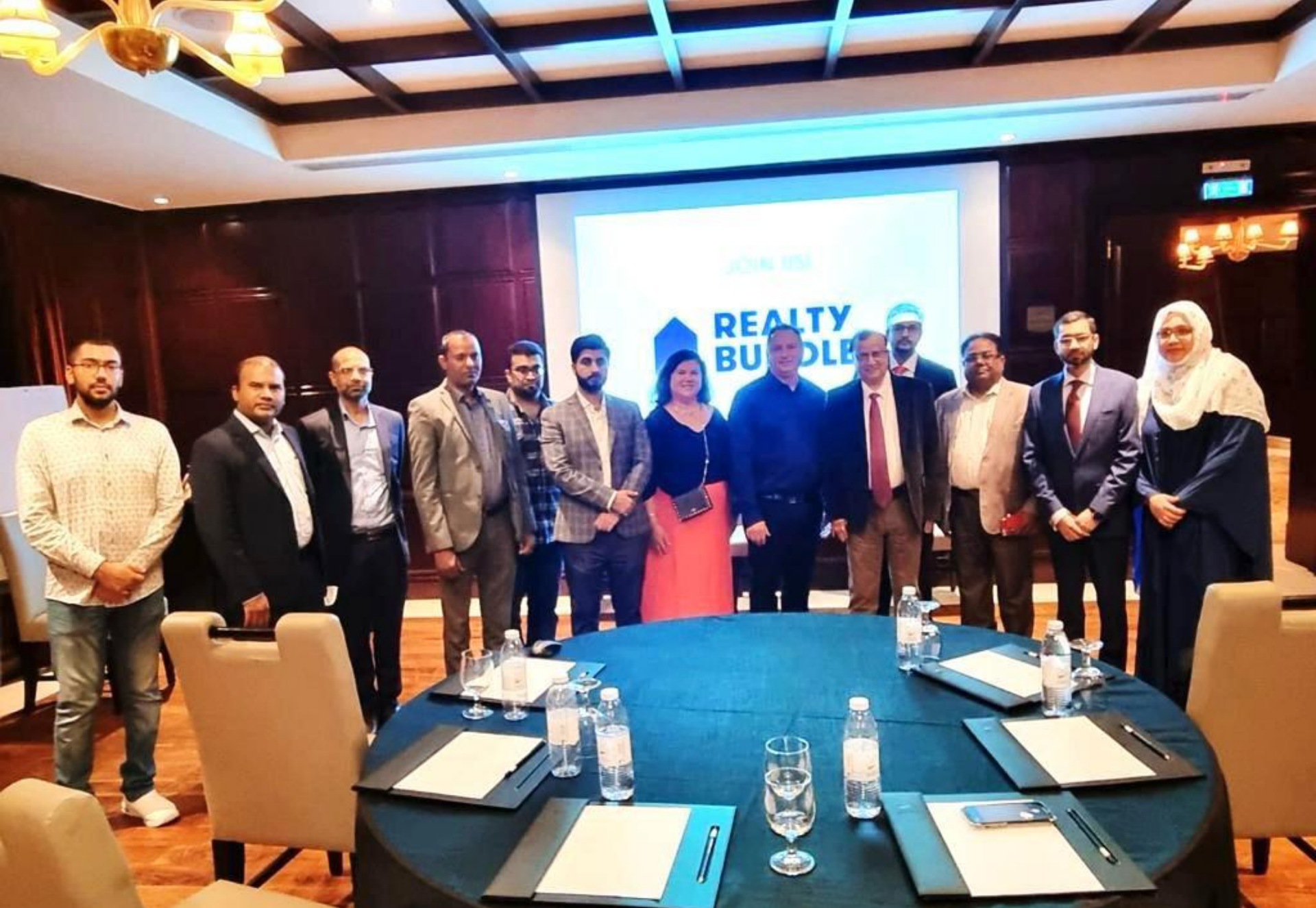
27 th Pelicans Lounge Investment Meeting on Fractional Real Estate Investing (Dec 2021)