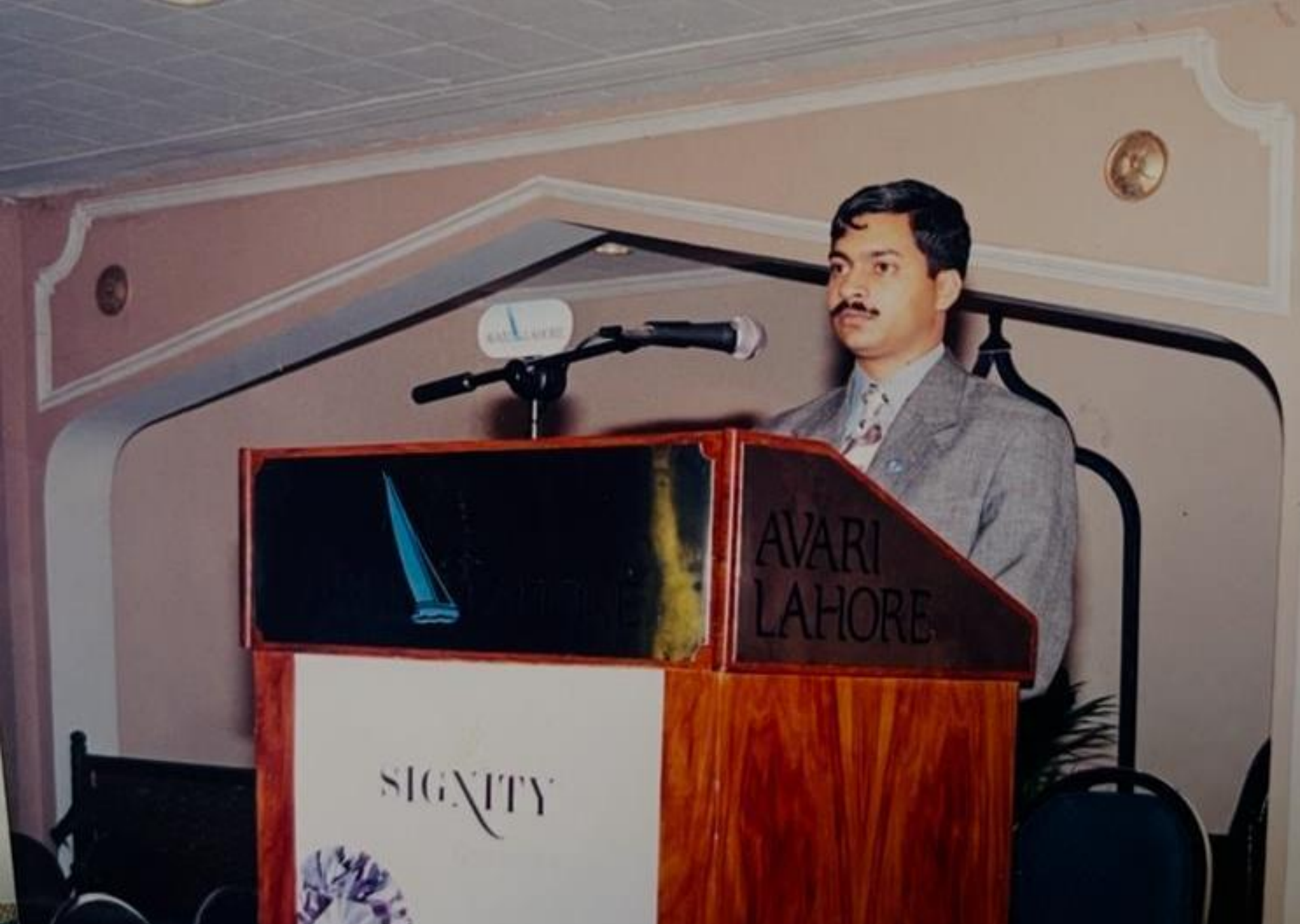
Strategic Communications at Hill & Knowlton - Asiatic (1999 - 2002)