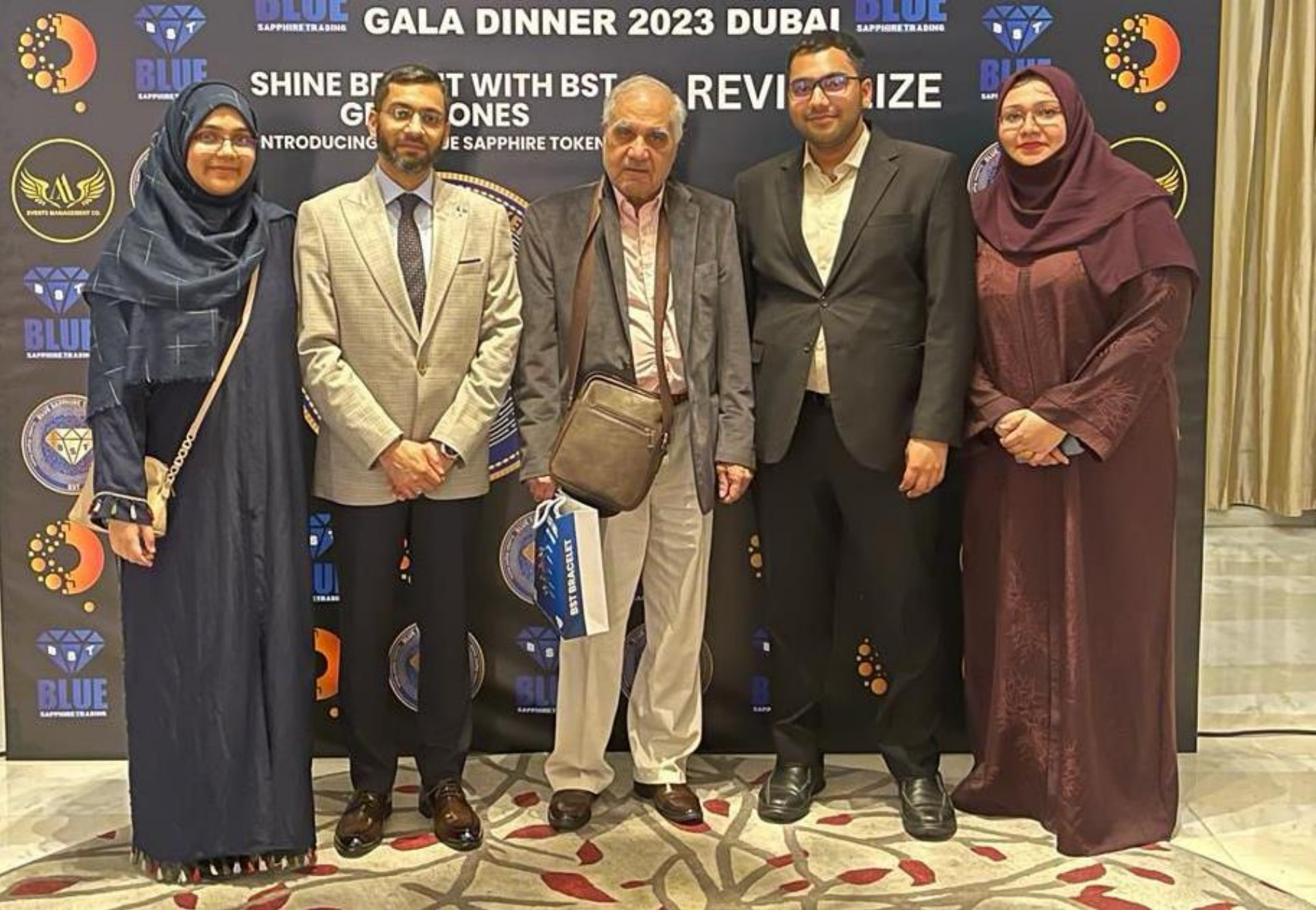
Blue Sapphire Token Annual Gala Dinner in Dubai (Sept 2023)