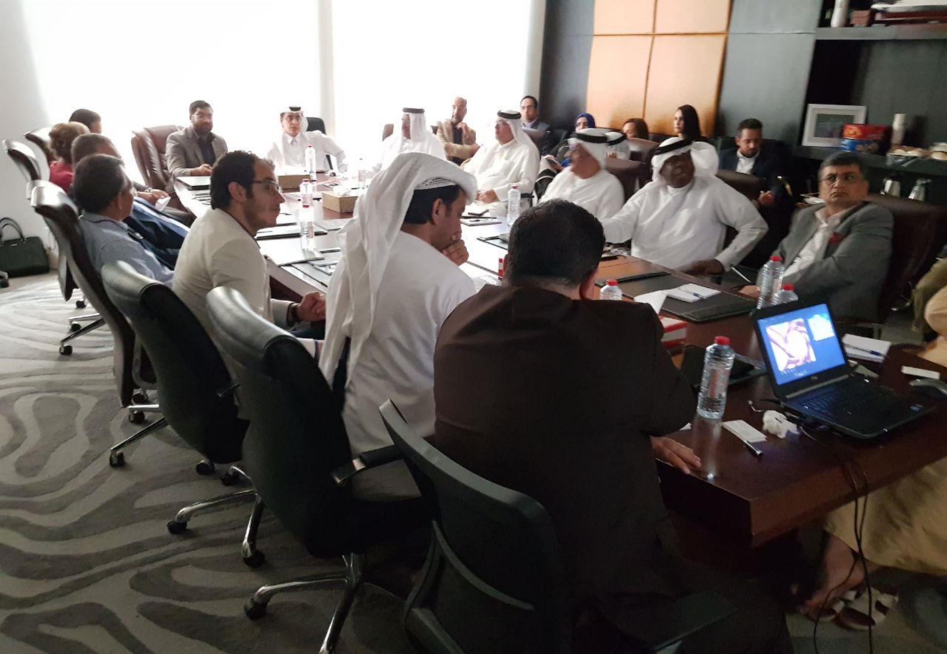
Premier Syndicate Investments' Assets Management Program launched in Dubai (2017)