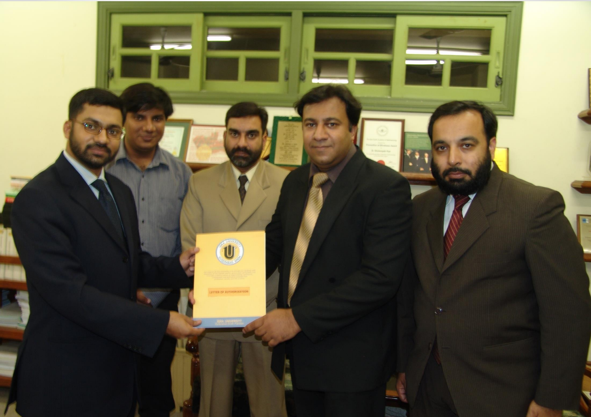
Fostering Academic-Industrial Cohesion (2007-2010)