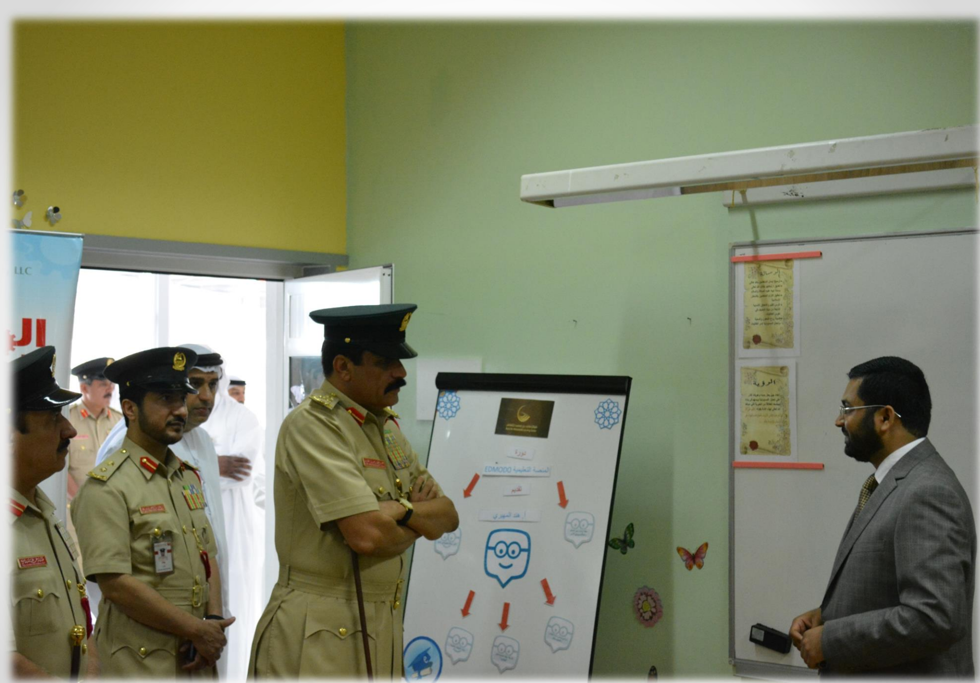
Dubai Police Chief visits Neurocognitive Development Initiative (2014-15)