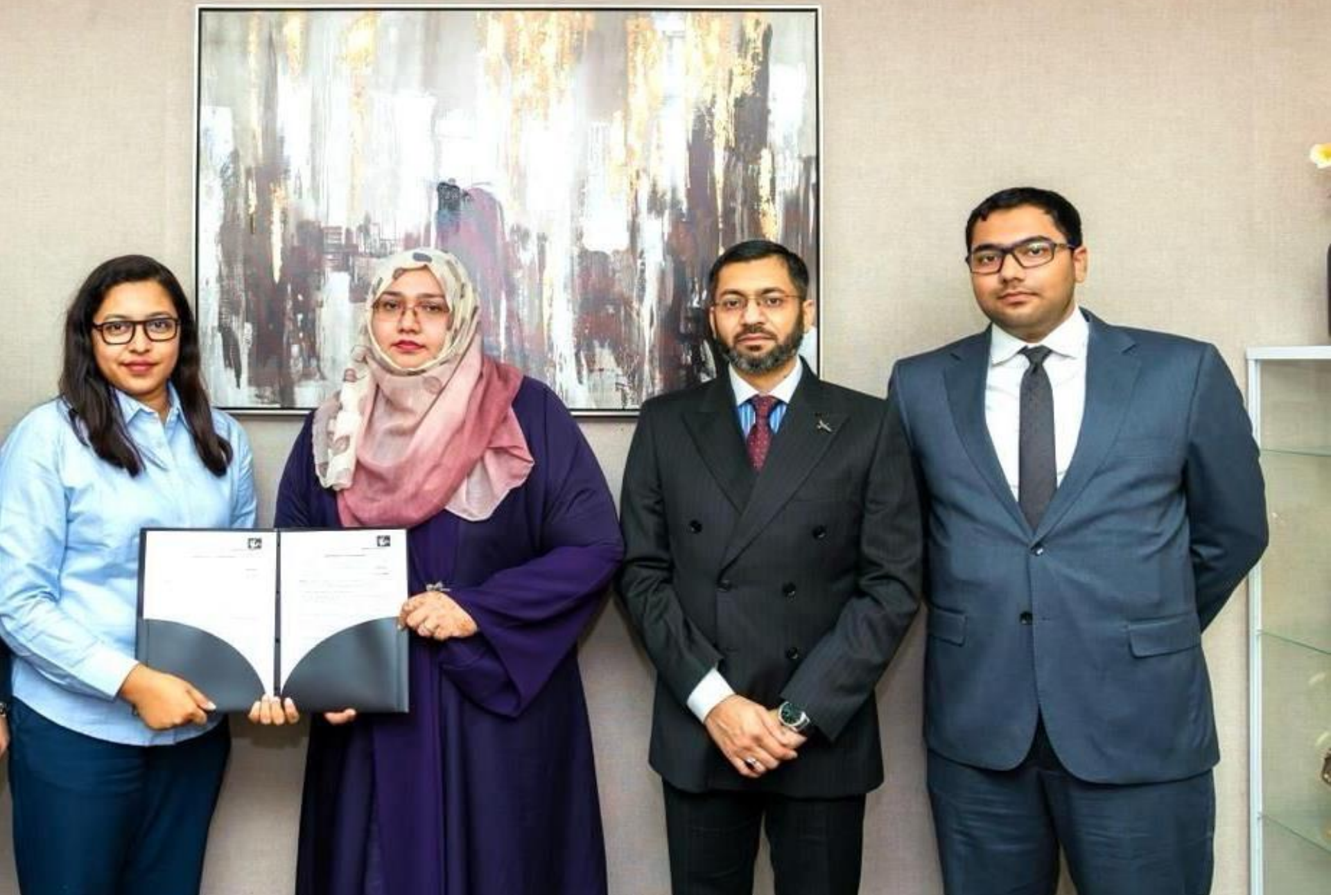
Signing Ceremony with DeTempete Dubai (Dec 2024)