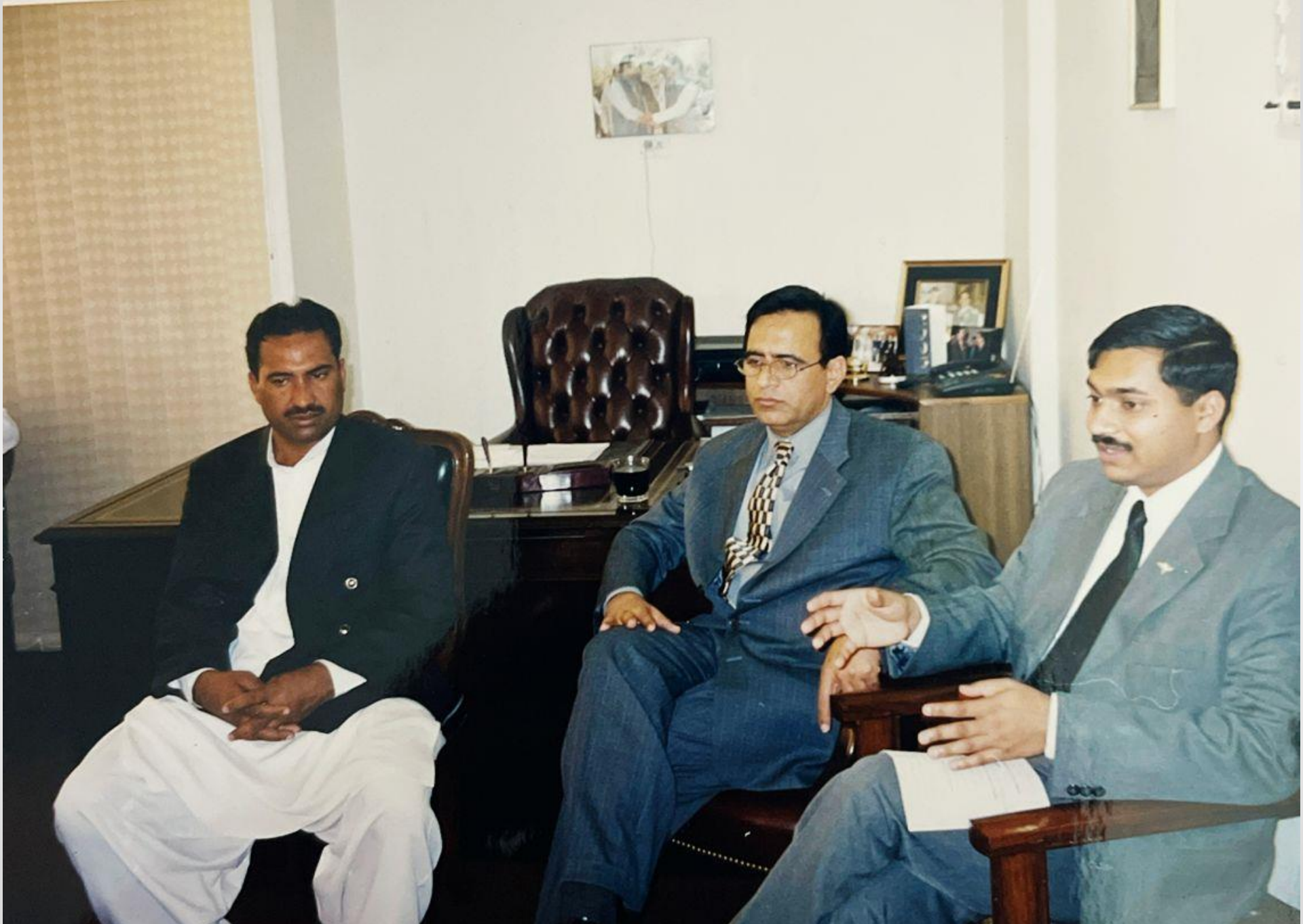
Social Sector Development Initiatives (2002 - 2003)