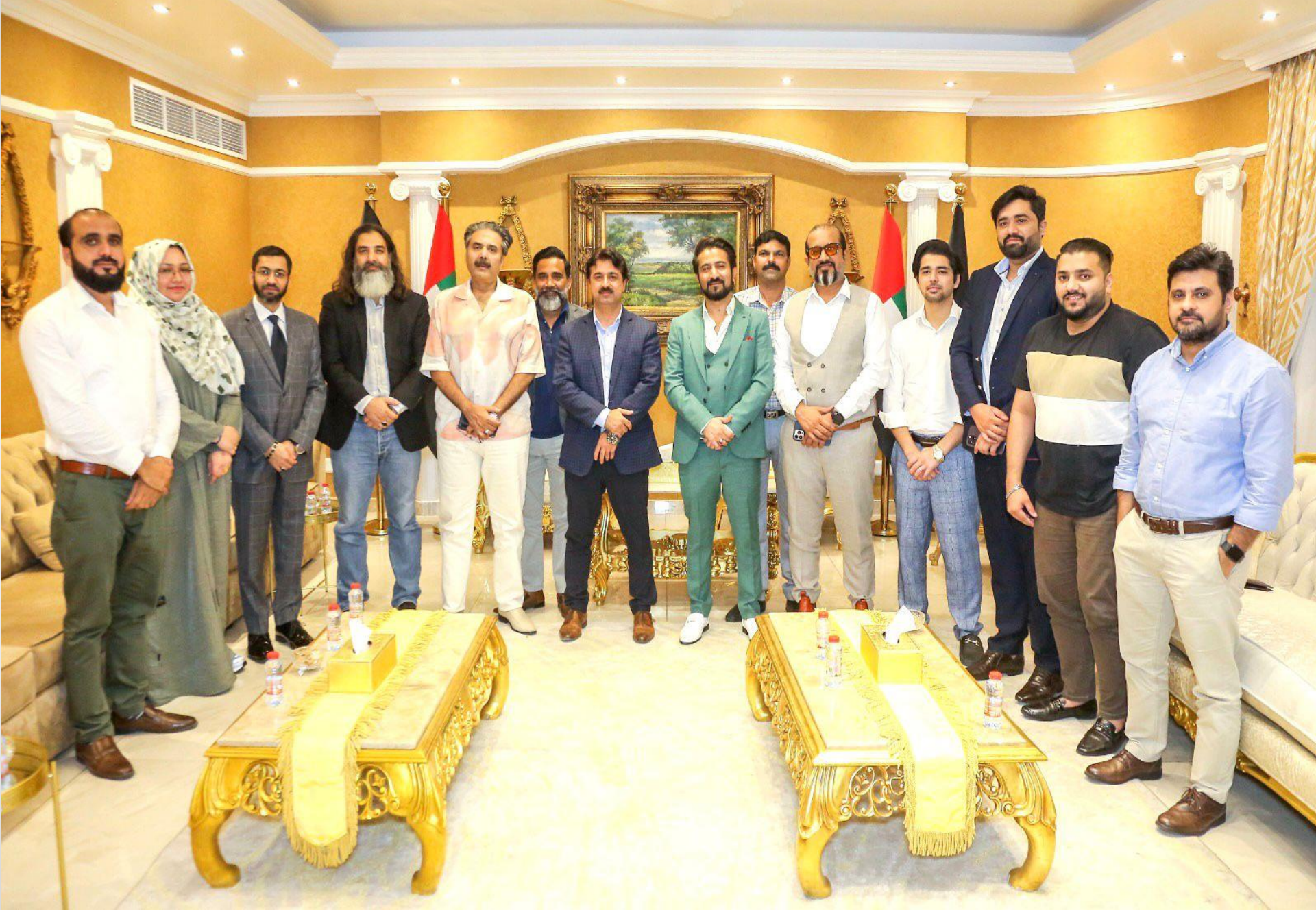
WePelicans sign Equity Partnership with Meer Group in Dubai (July 2023)