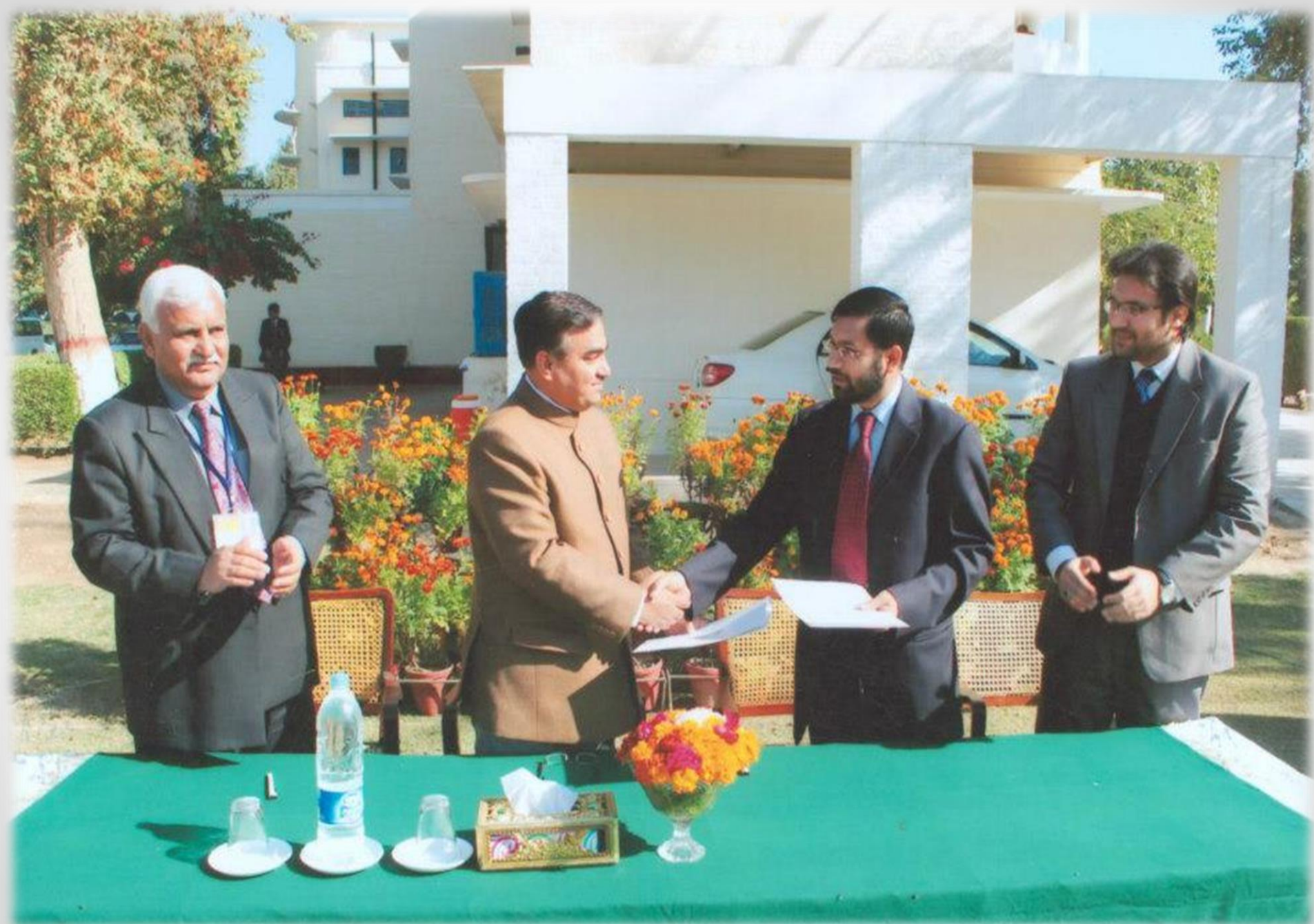
BSRC supported Neurocognitive Development Initiative at Academic Institutions (2012-15)