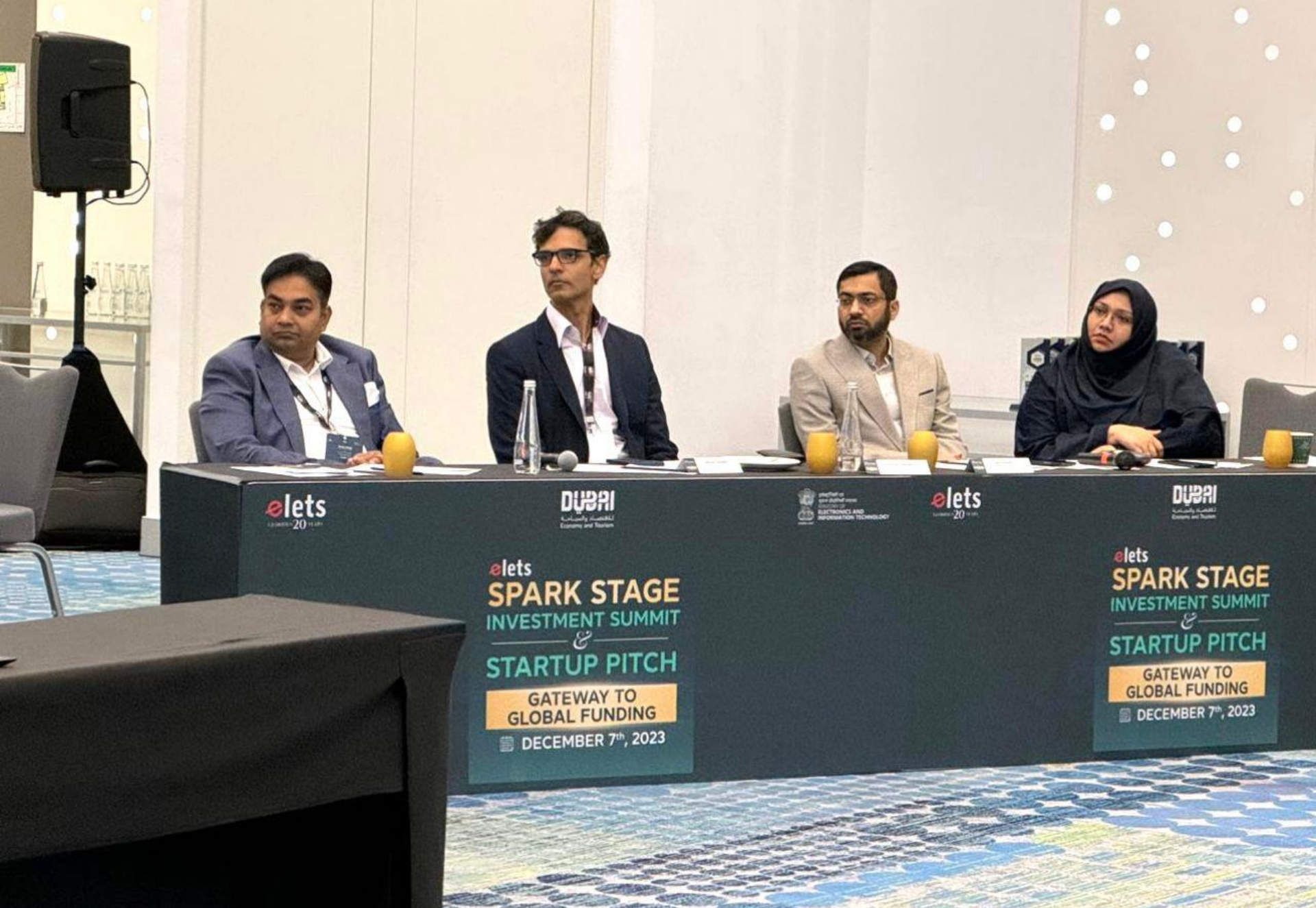
Judge at SPARK Stage Investment Summit Dubai (Dec 2023)