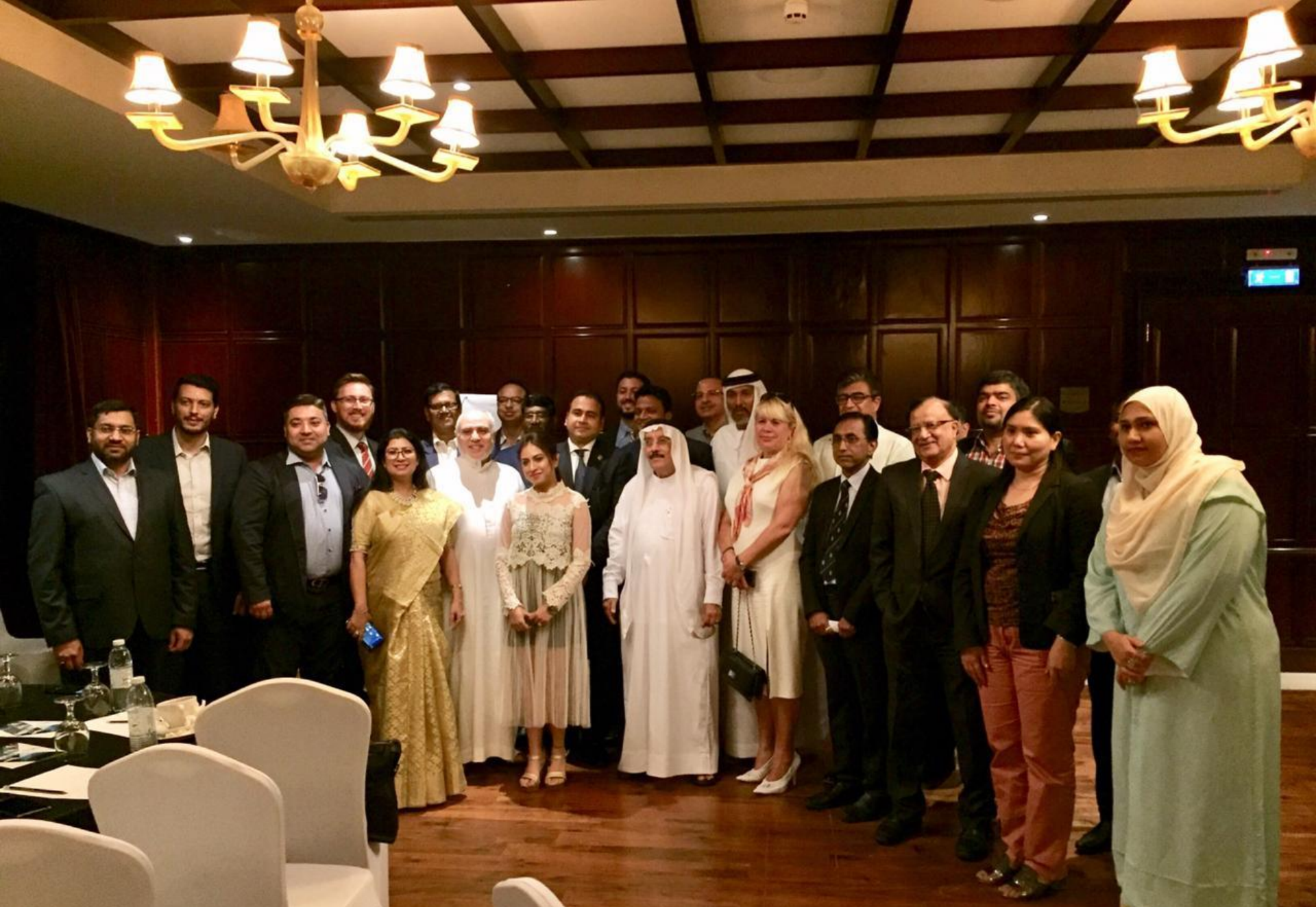
Pelicans Lounge Investment Meetings (2018-25)