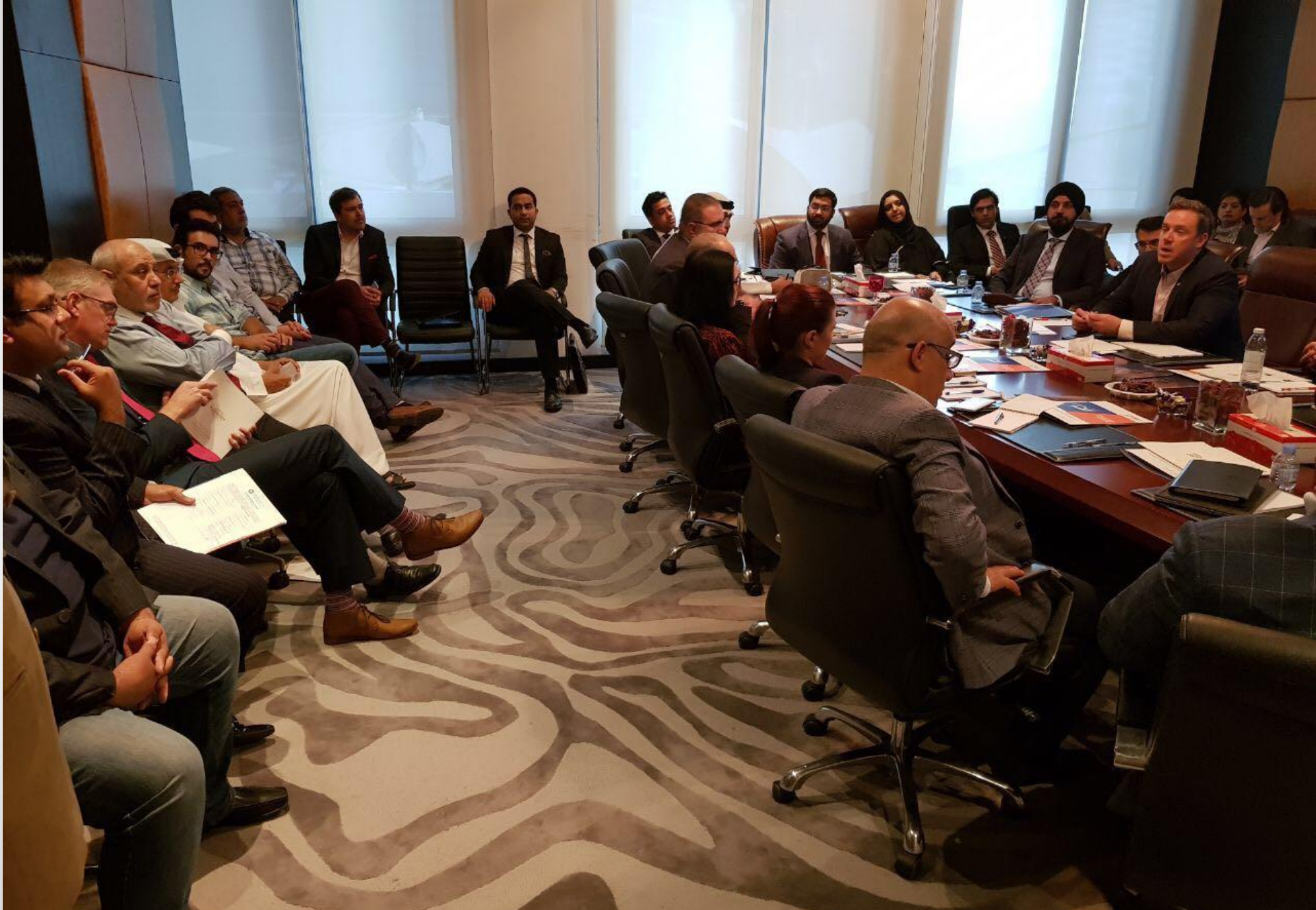
Carlton James Diversified Alpha Fund Presentation – Dubai (2017)