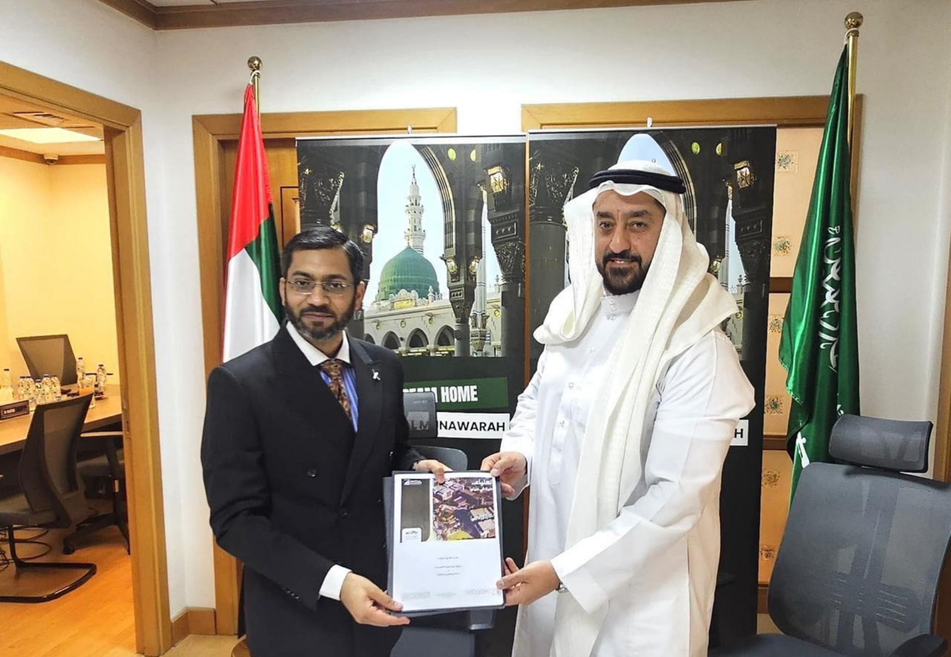
Signing Ceremony with Knowledge Economic City of Madinah (March 2025)