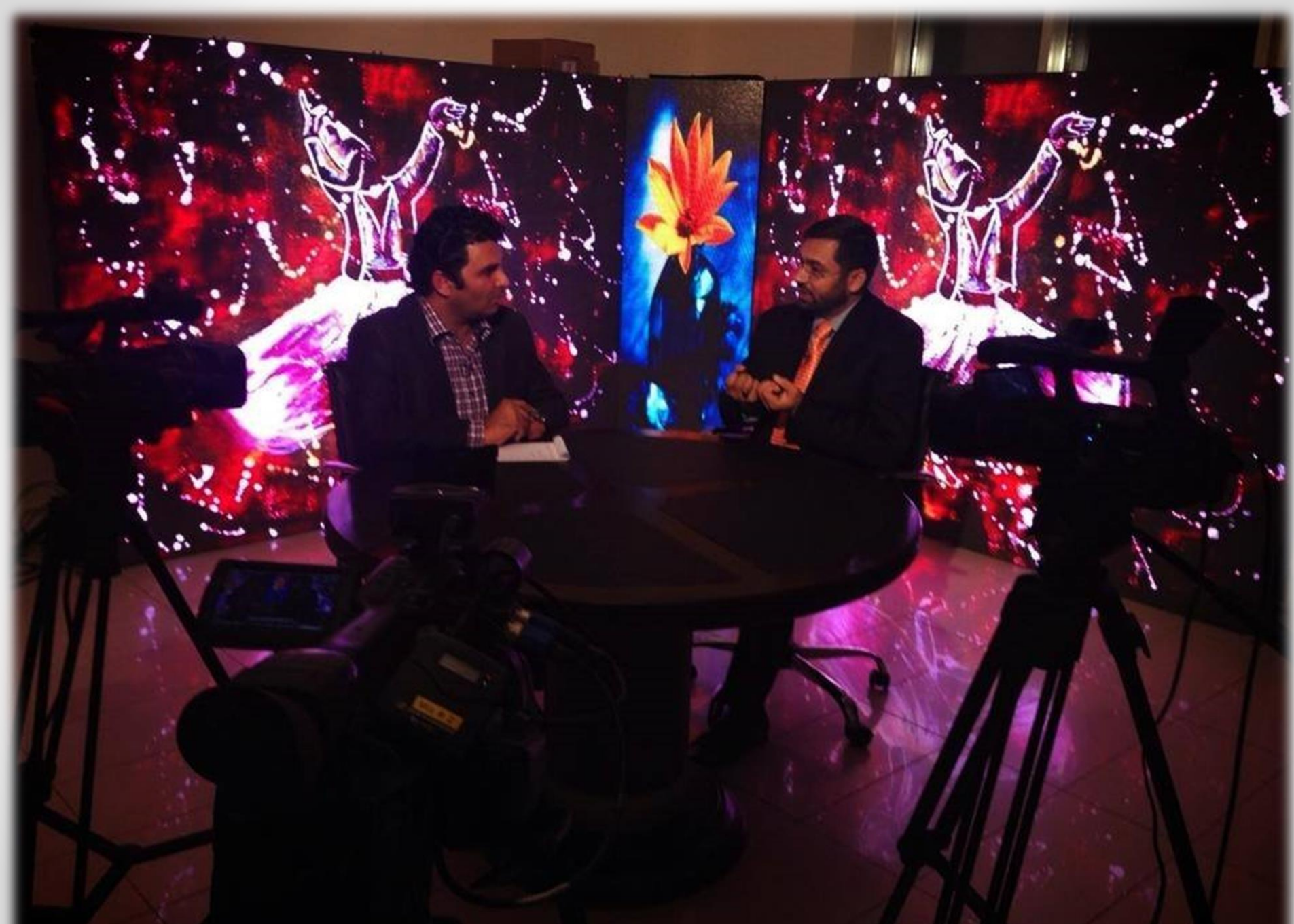
Focused Media Interaction on “Human Relations” (2013-14)