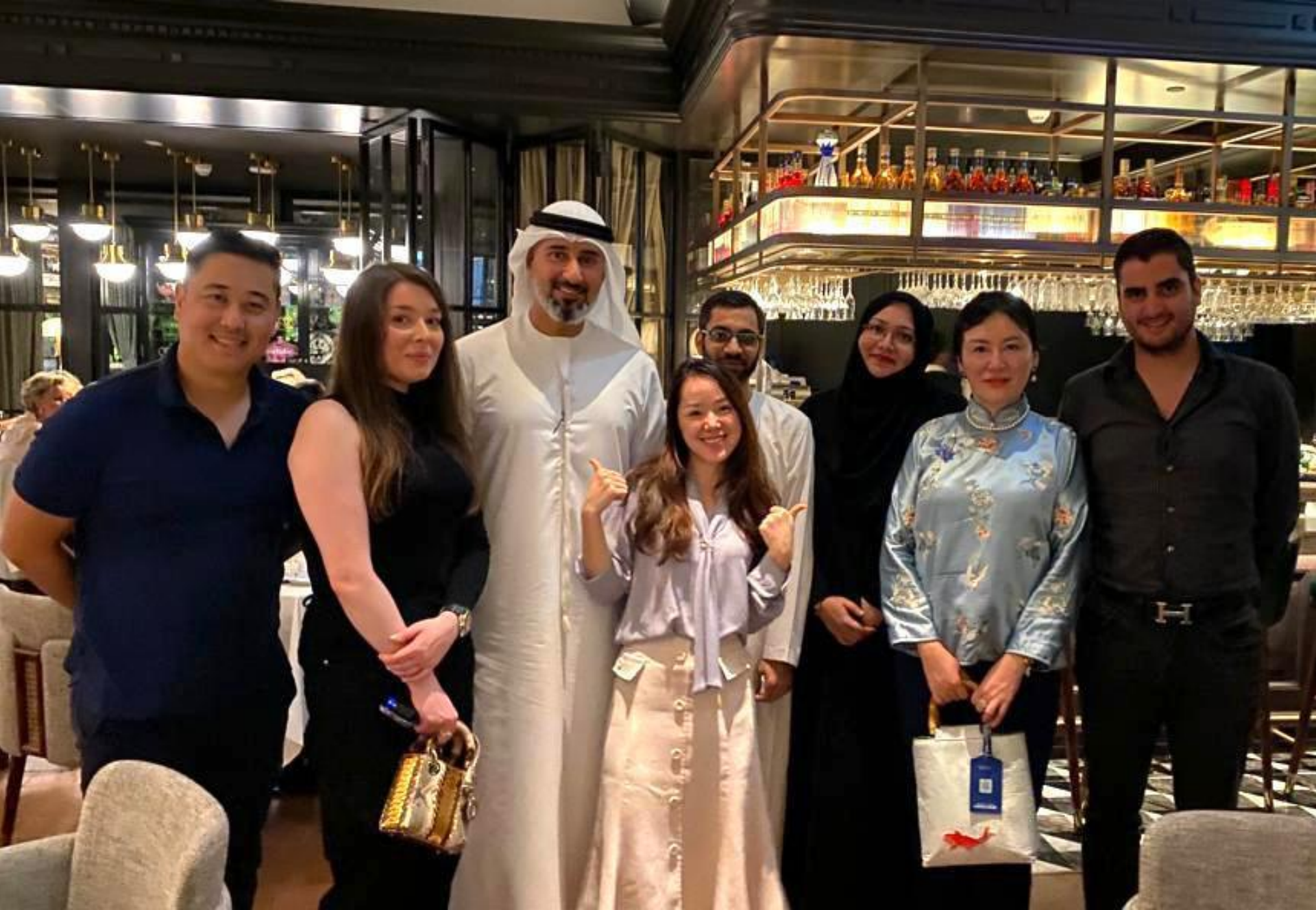
ALGORAND Foundation Dinner in Dubai (Nov 2022)