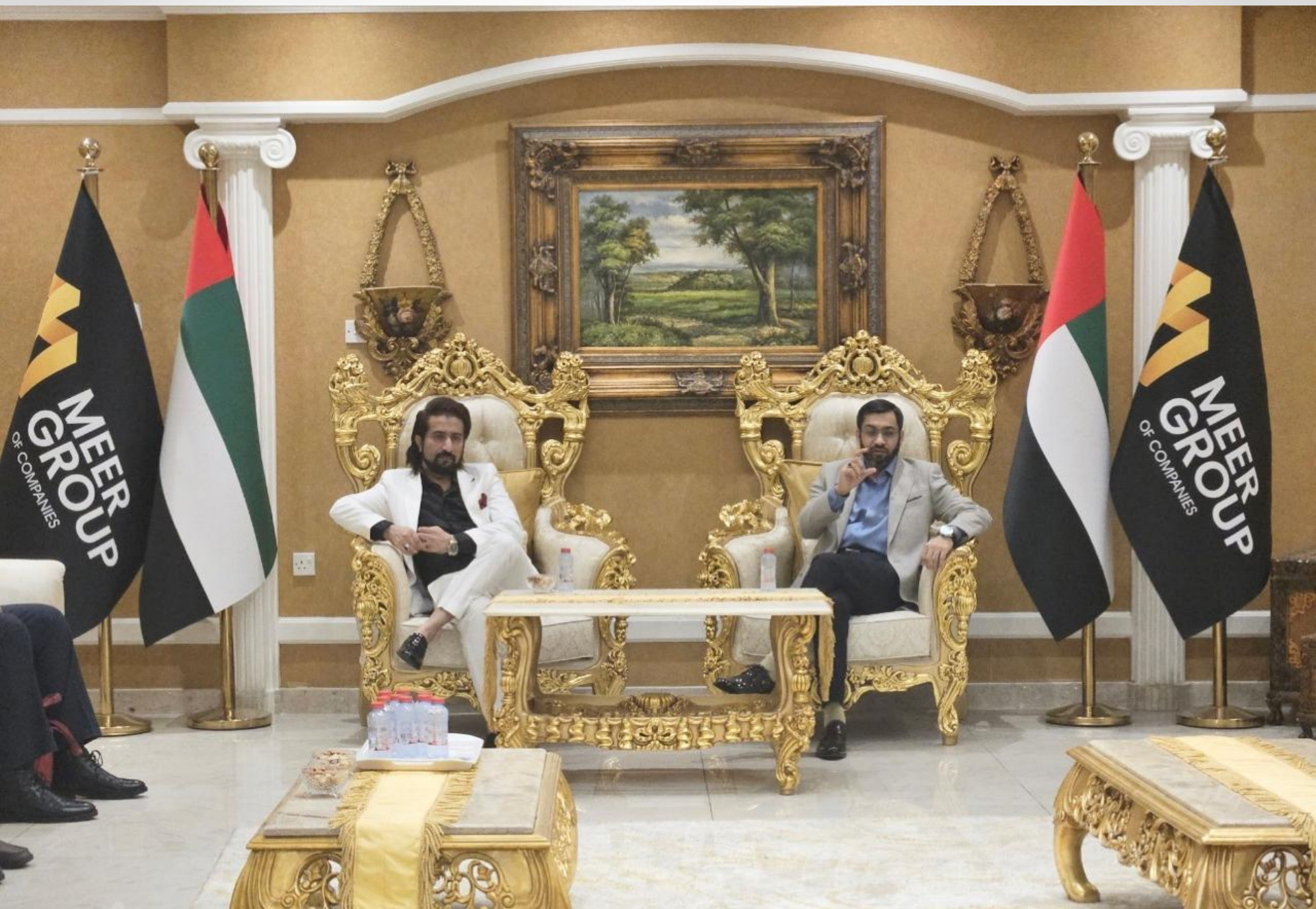
Focused Meeting with Chairman of Meer Group in Dubai (Feb 2024)