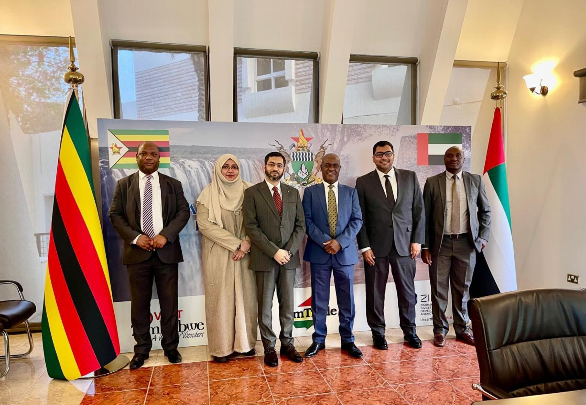
Meeting with H.E. Lovemore Mazemo, Ambassador of Zimbabwe in Abu Dhabi (Oct 2024)