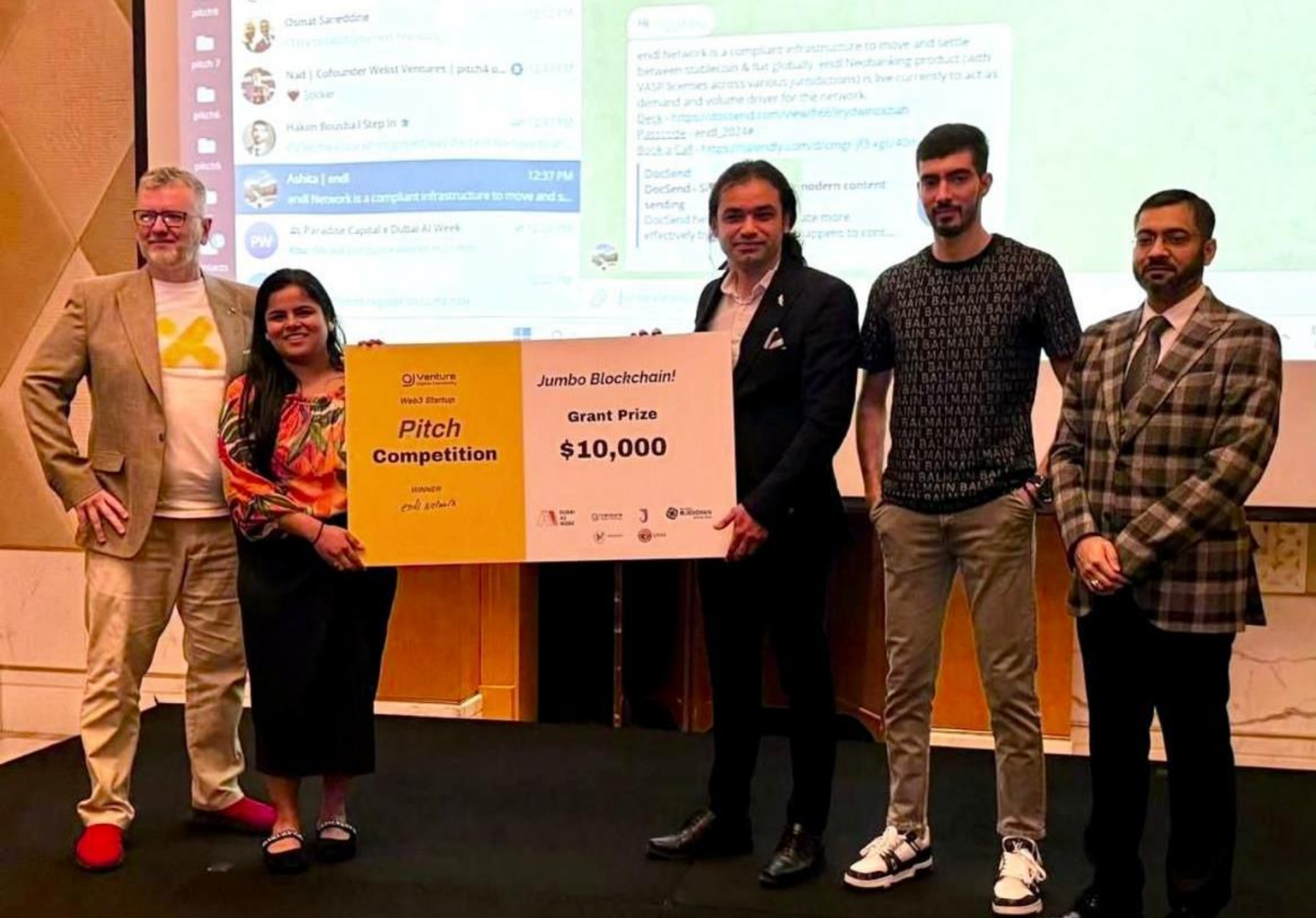
Judge at Paradise Capital Startup Pitch Competition in Dubai (Dec 2024)