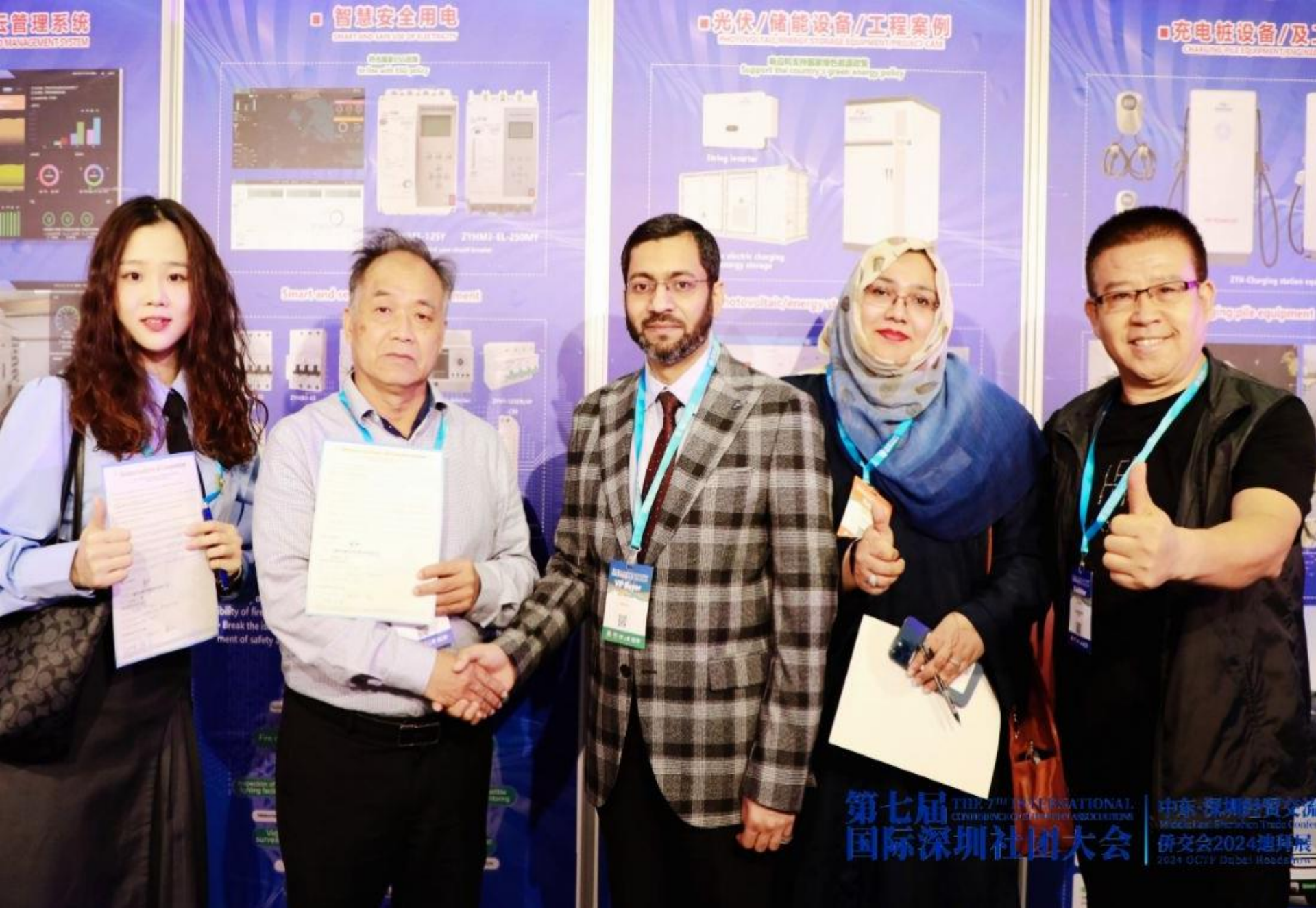
Middle East Shenzhen Trade Conference in Dubai (Nov 2024)