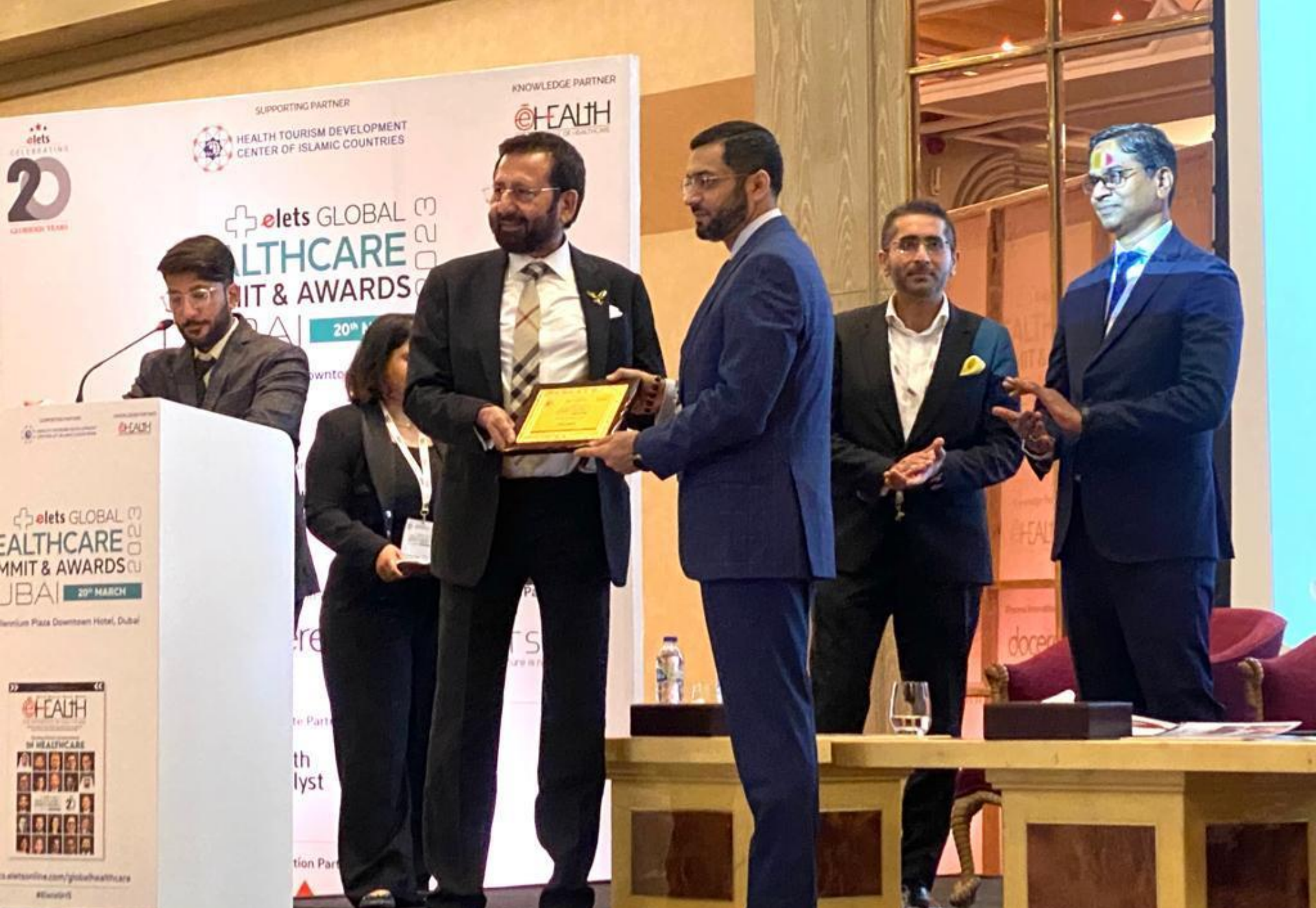
WePelicans President honored at Healthcare Summit & Awards in Dubai (March 2023)