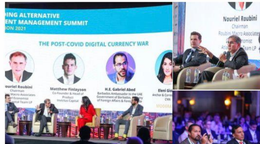
AIM Summit (Nov 2021)