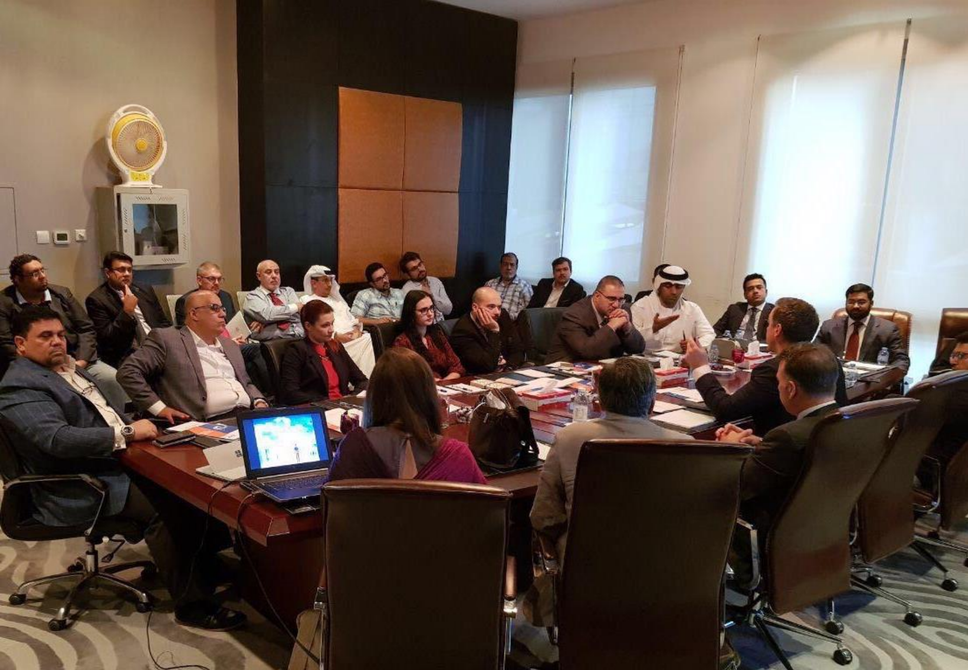
Premier Investment Meetings – Dubai (2016-18)