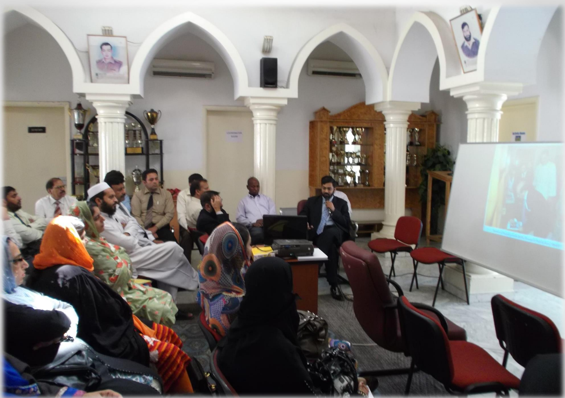
Teachers NDI Factor Training on “Talent Identification in Classroom” (2013-18)