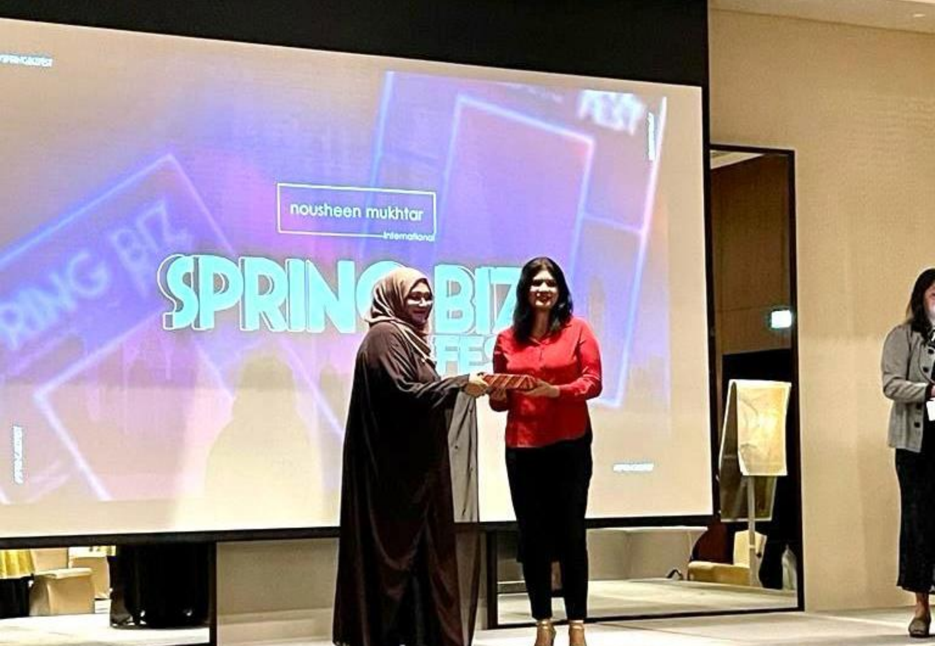
MD WePelicans honored at SPRINGBIZ Festival in Dubai (2022)