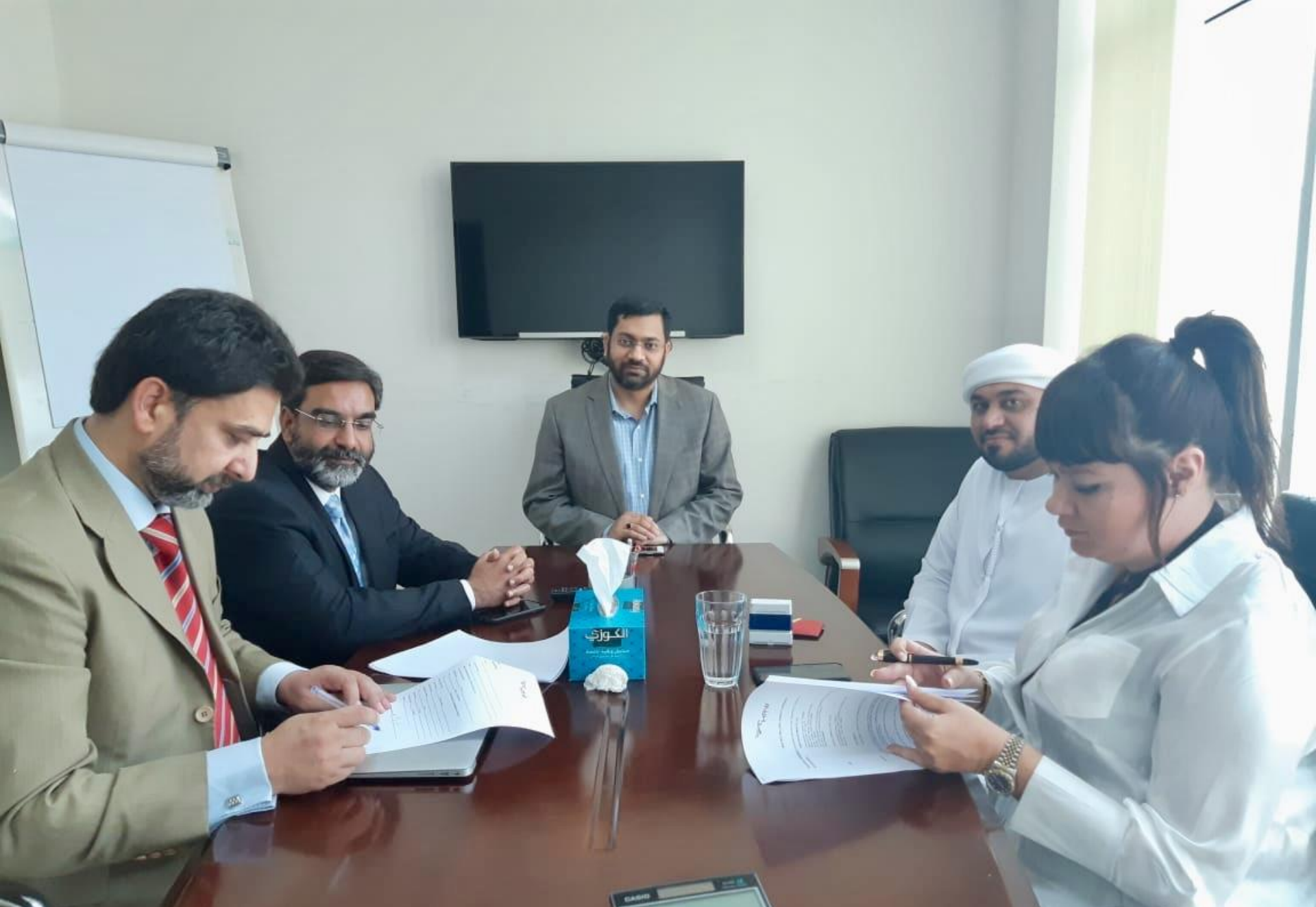
Promoting Inclusivity in Fractional Equity (2018)