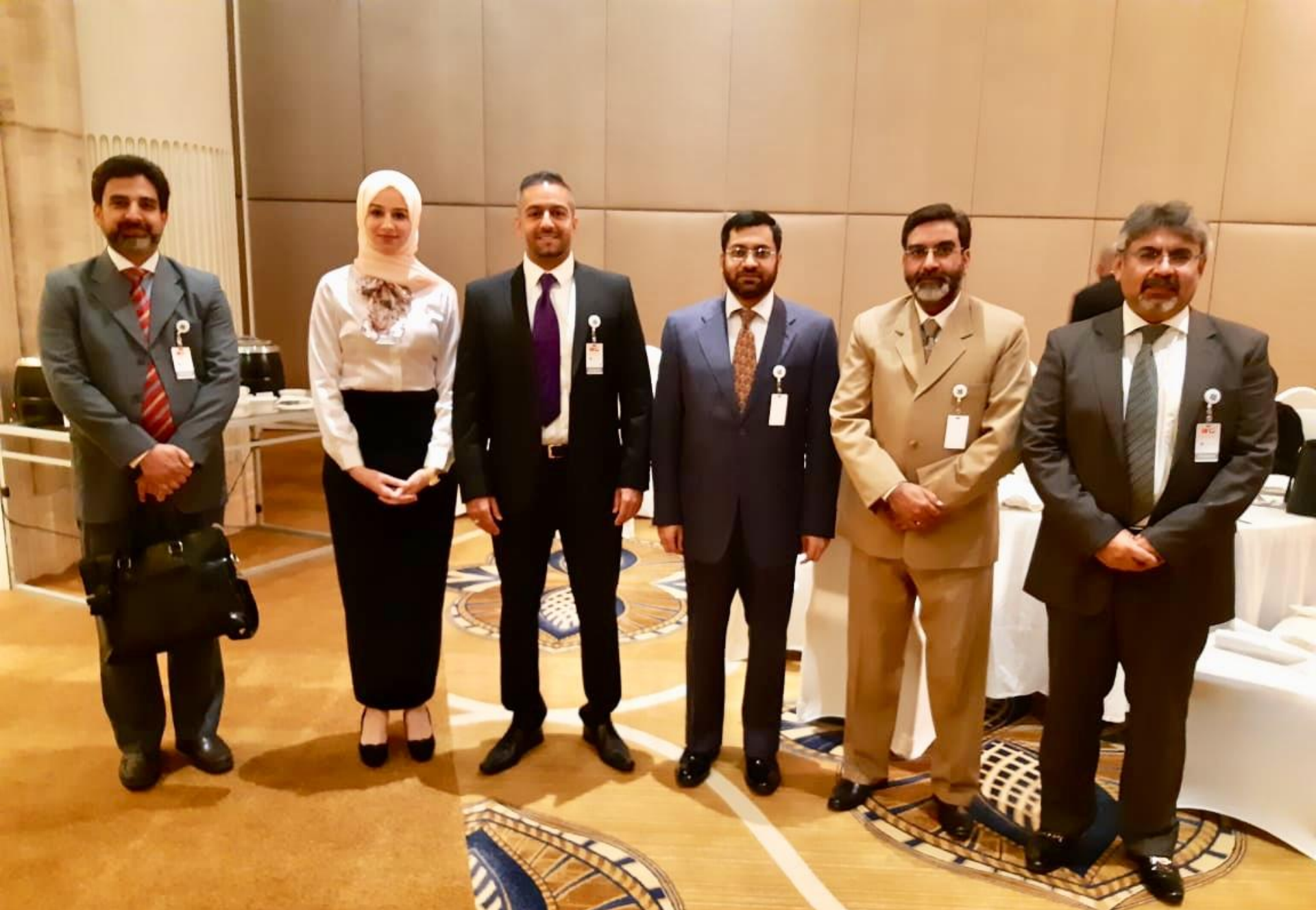
Bolstering Focused Interaction for Multilateral Trade and Investments (2018-19)