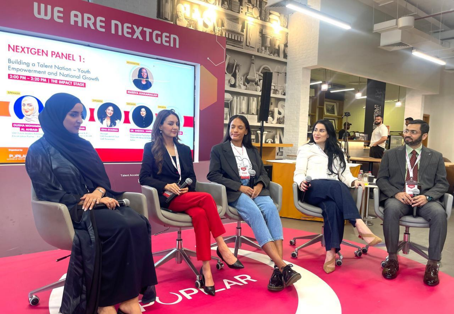
Panel: Building a Talent Nation: Youth Empowerment and National Growth (June 2025)