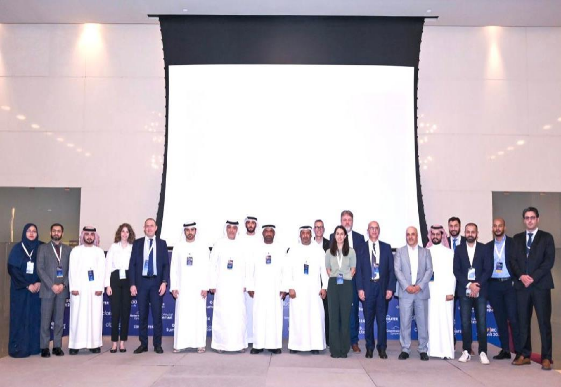
WePelicans participated in the 1 st GpRC Summit held in Abu Dhabi (Nov 2023)