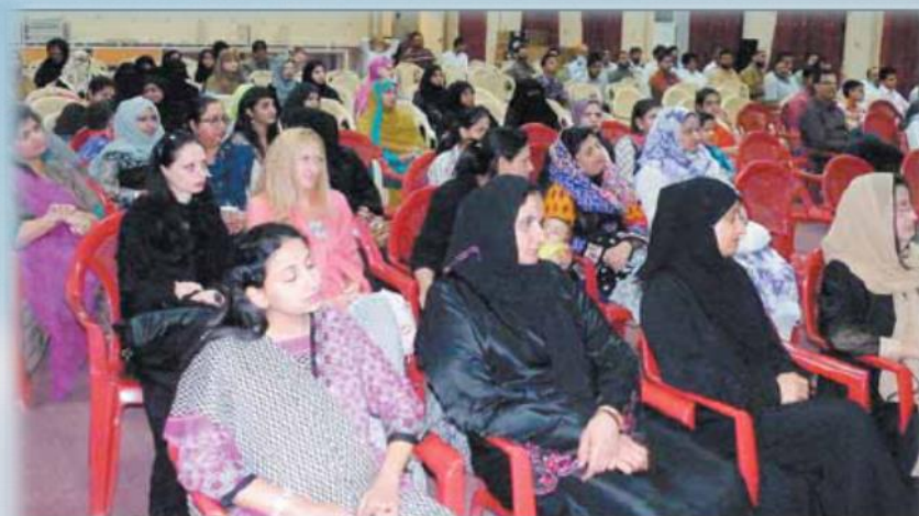
Guests and officials at the career counselling programme, in Doha, on Thursday.