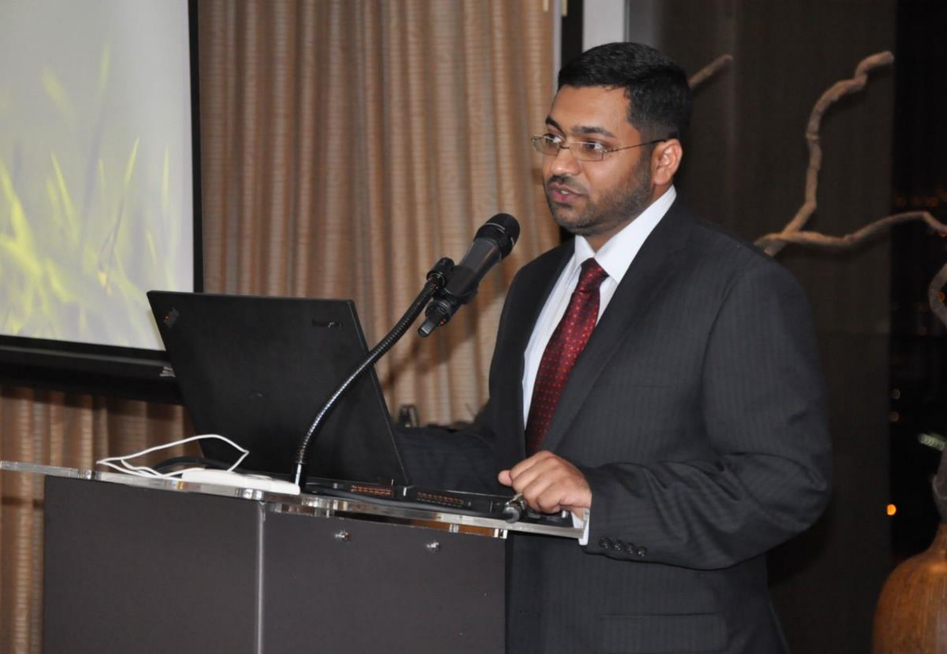
Keynote Speech at Dubai Investment Summit (2016)