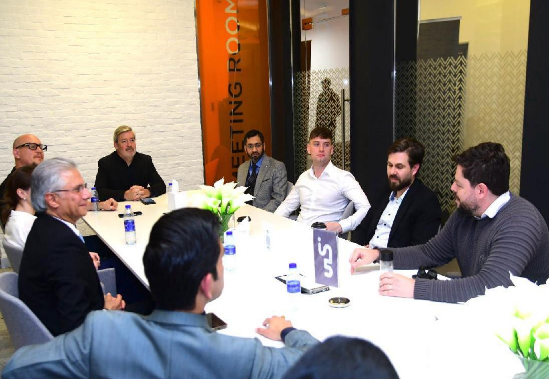
Web 3.0 Investment Summit at in5 Dubai (Jan 2025)