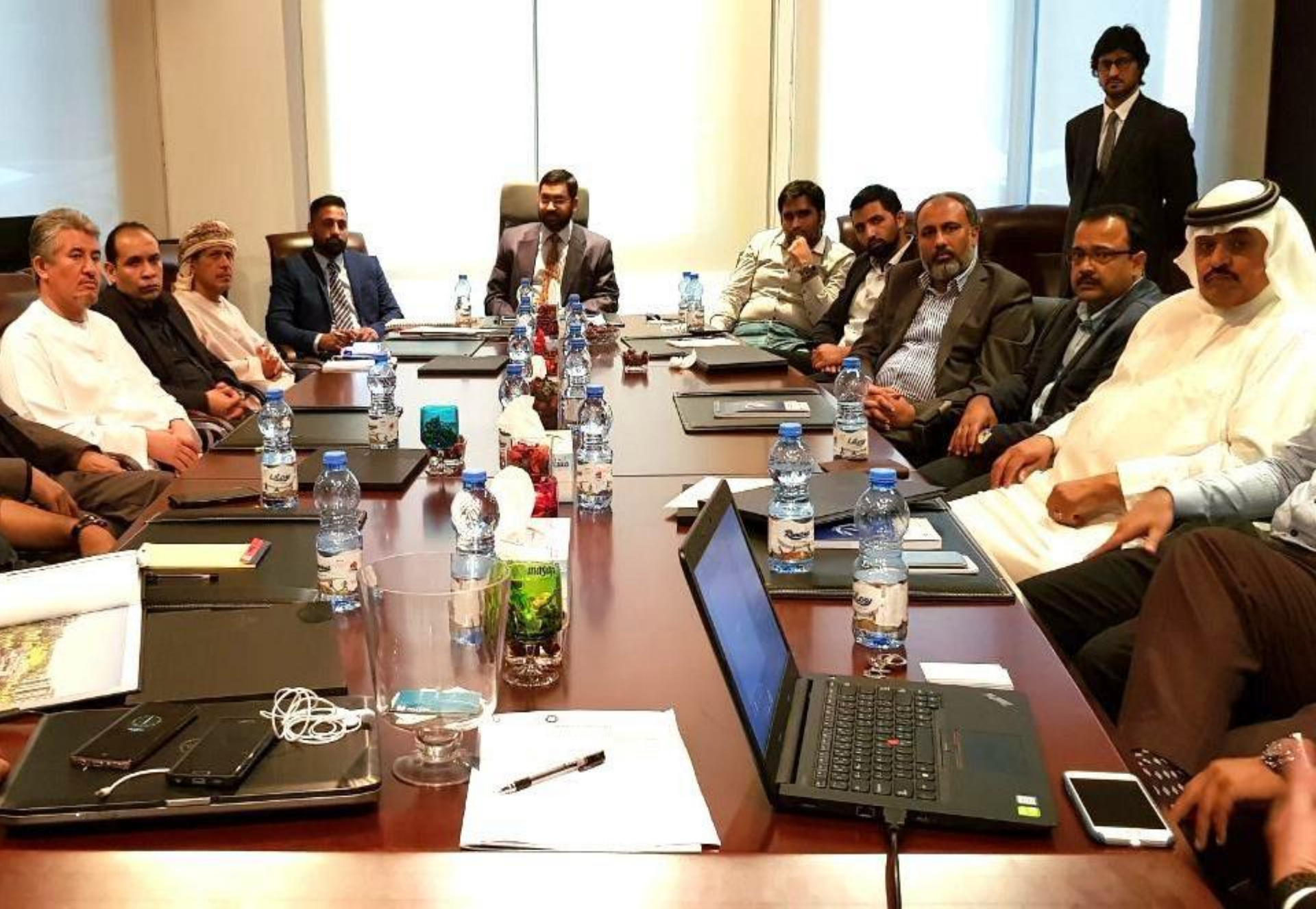
Real Estate Sector Investments - Premier Investment Meetings (2018)