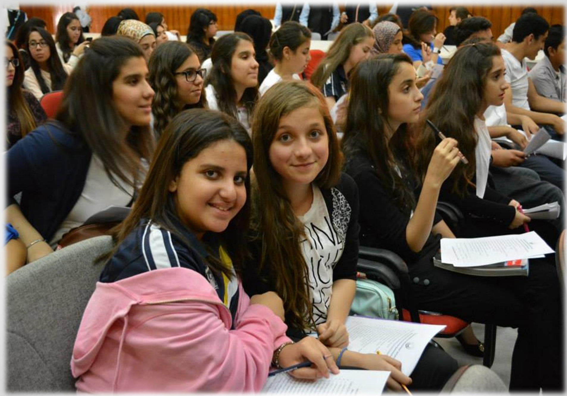
AIMS – Aptitude Inference Mapping System Analysis at Academic Institutions (2014-20)