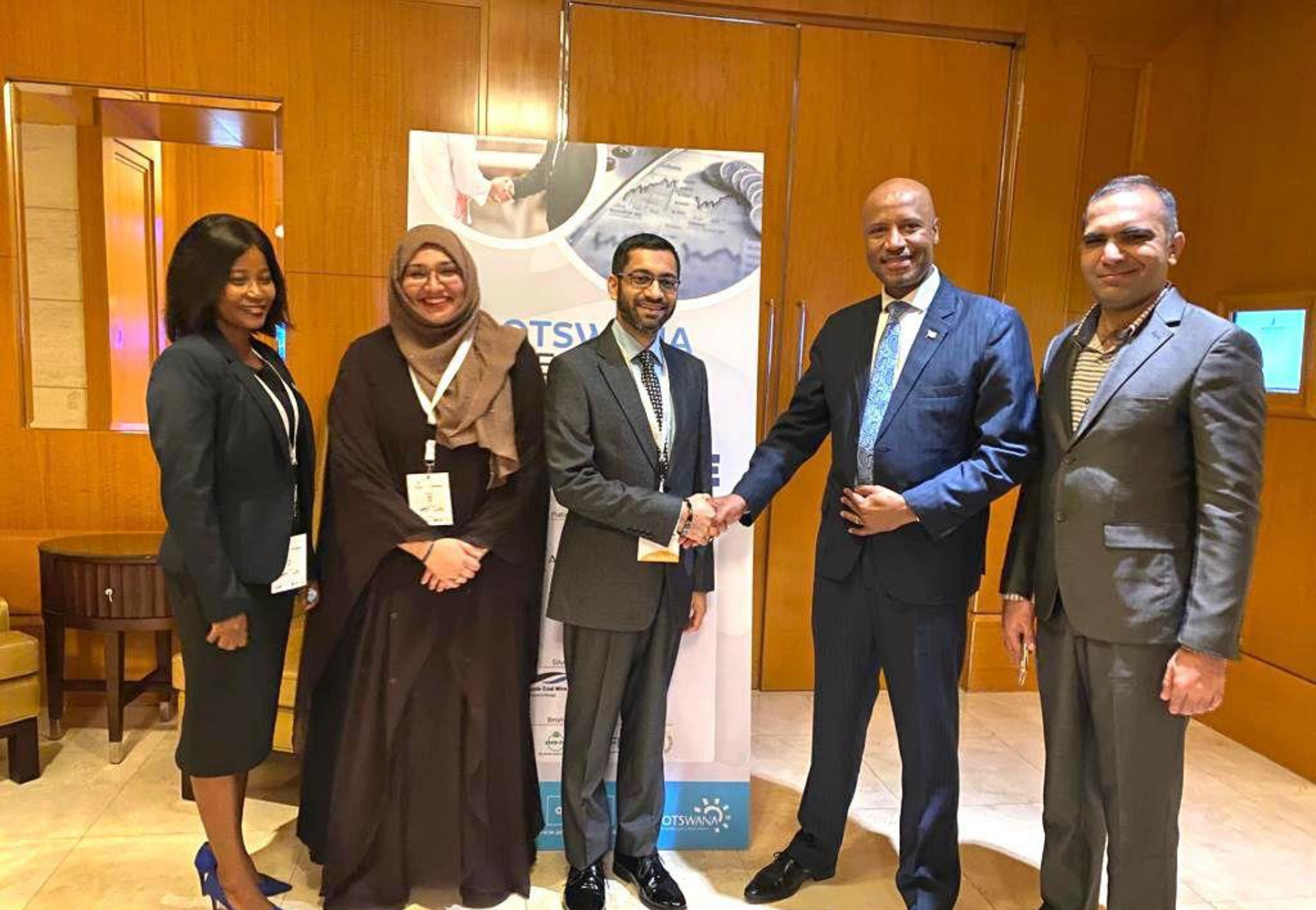
Botswana Invest (March 2022)