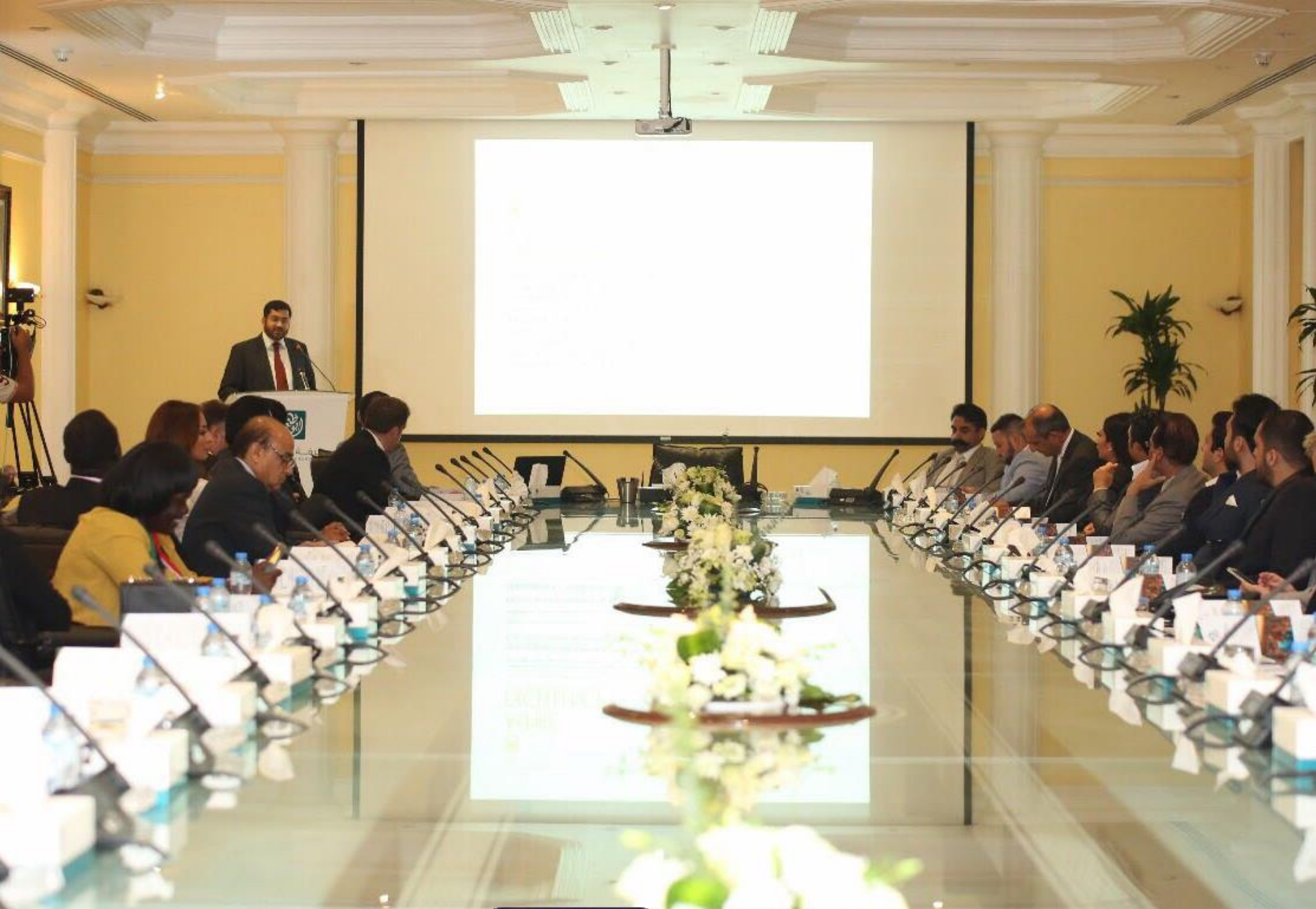
Keynote Speech during Investment Summit at Abu Dhabi Chamber of Commerce – (2016)