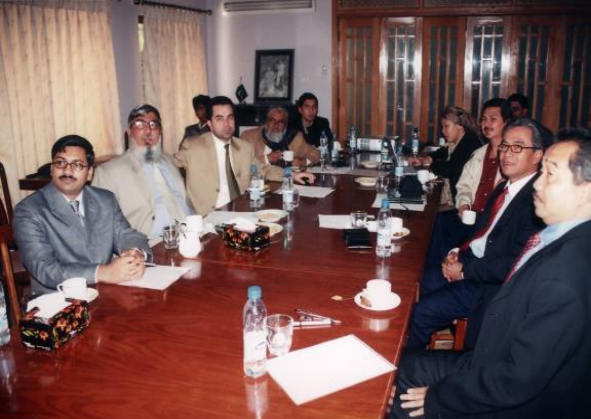
Private Equity Investment Syndication (2004-07)