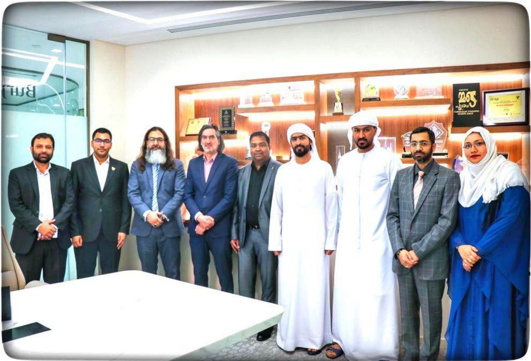
Workshop on Future of Urban Digital Twins at NIKAI offices in Dubai (March 2023)