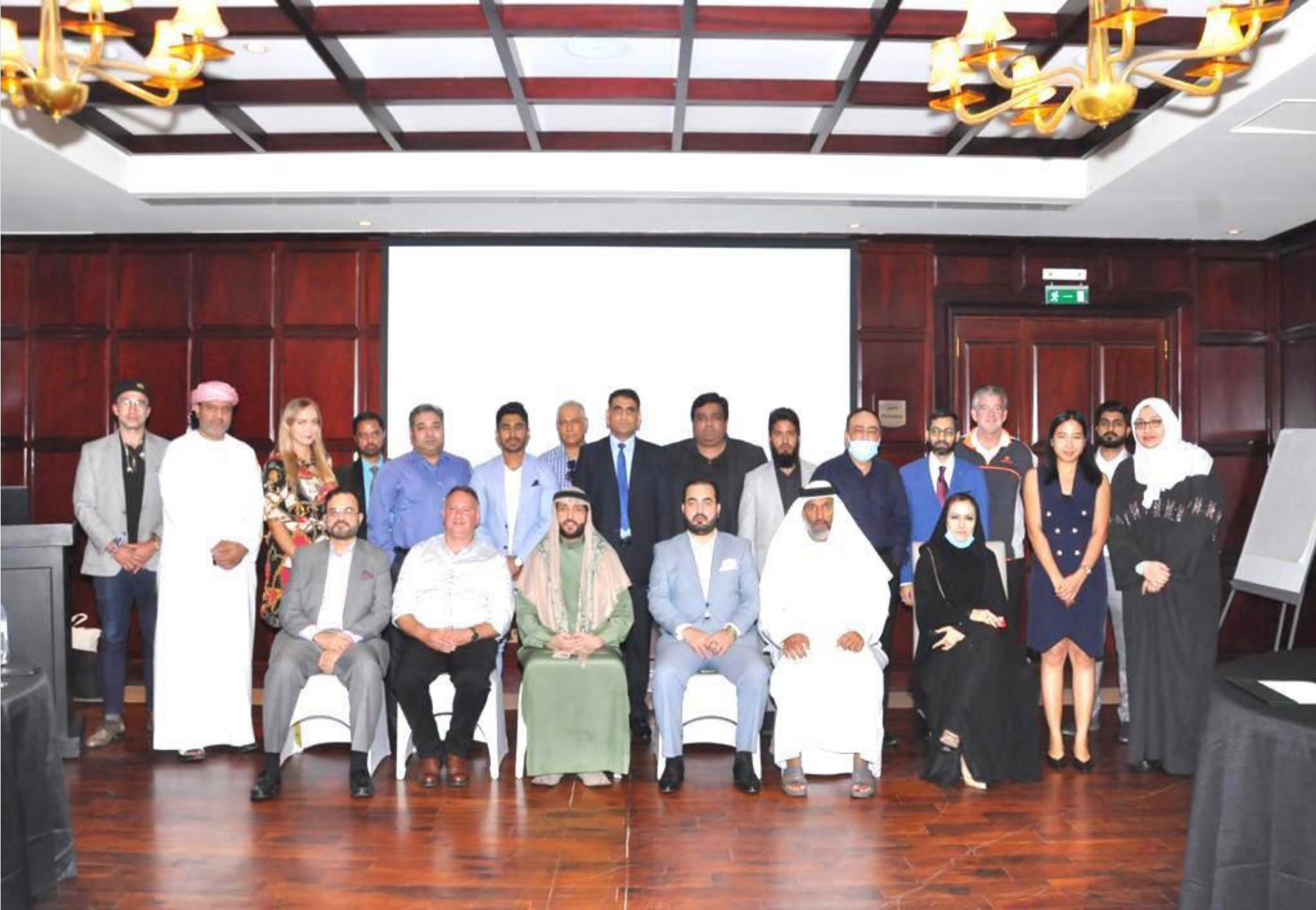
28 th Pelicans Lounge Investment Meeting (Dec 2021)