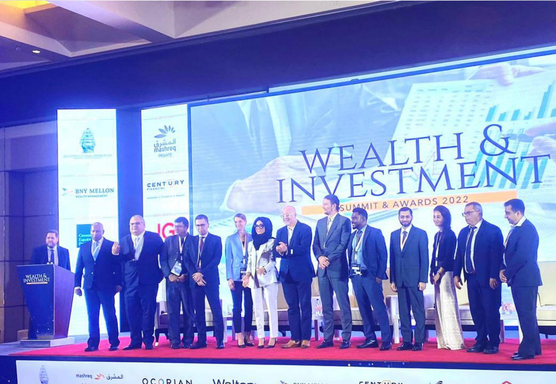
Wealth & Investment Summit (Sept 2022)