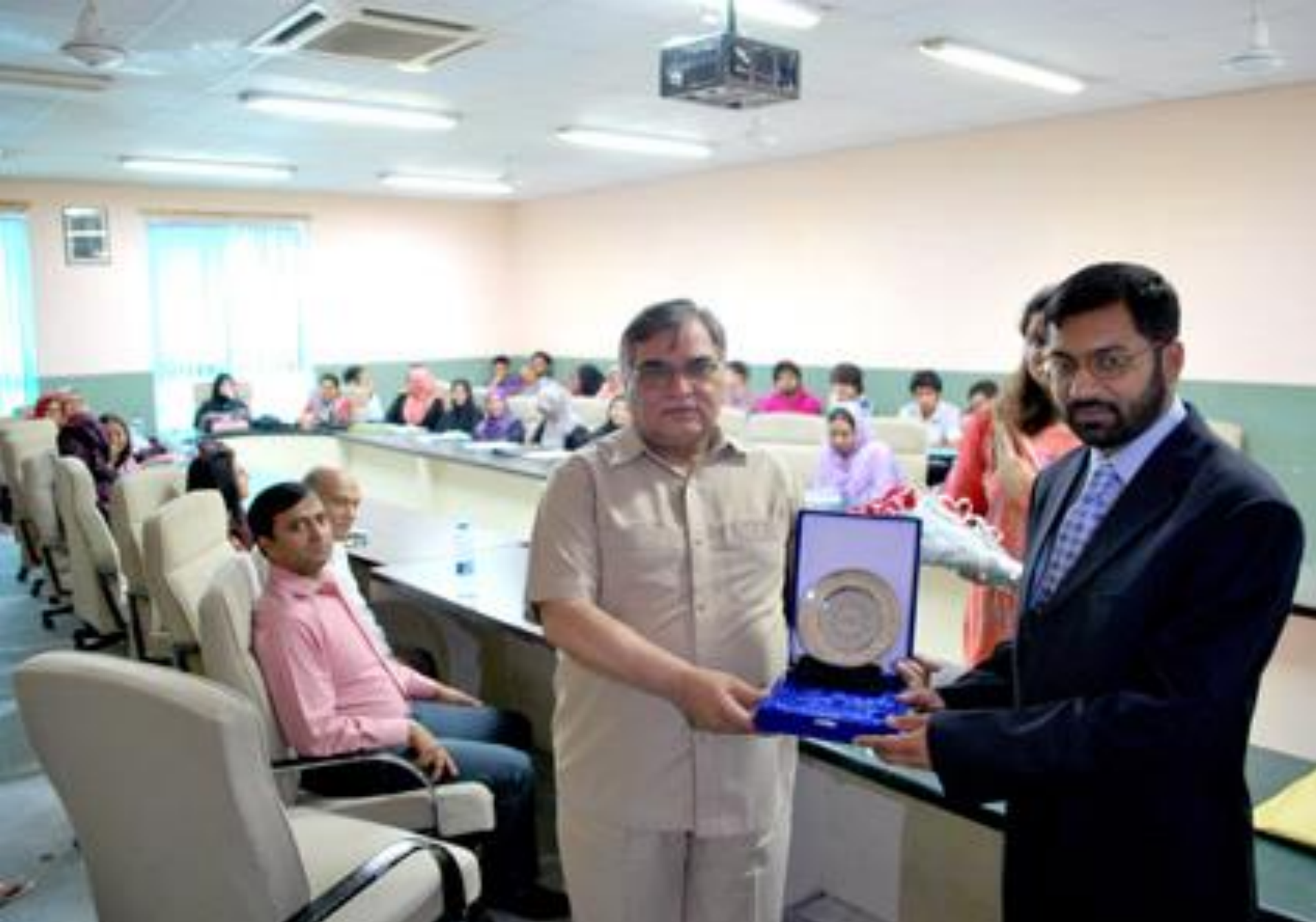
BSRC supported University Lecture Series on “NeuroCognitive Development” (2010-2016)