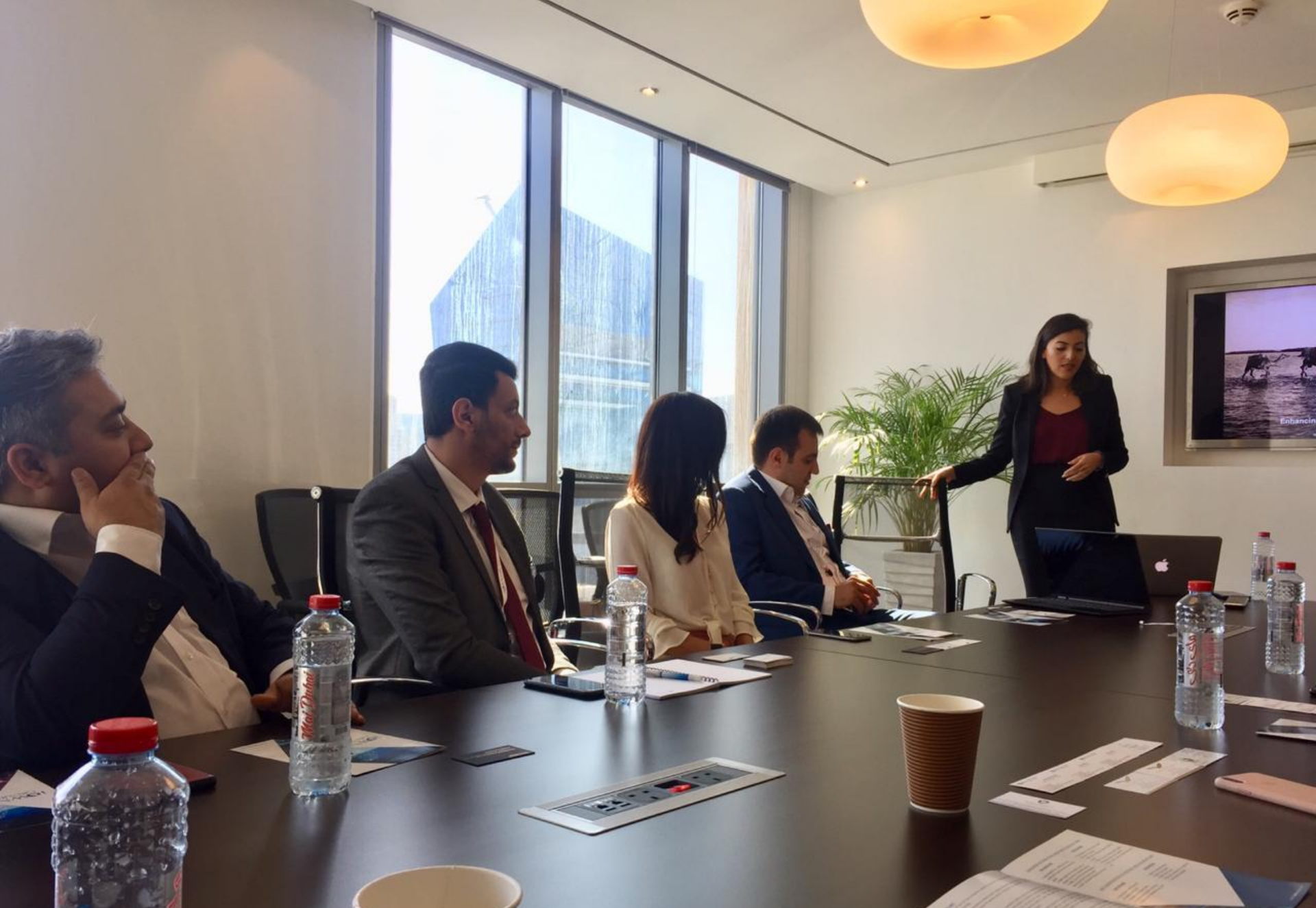
Capital Efficiency Optimization (CEO) Workshop Series (2019-24)