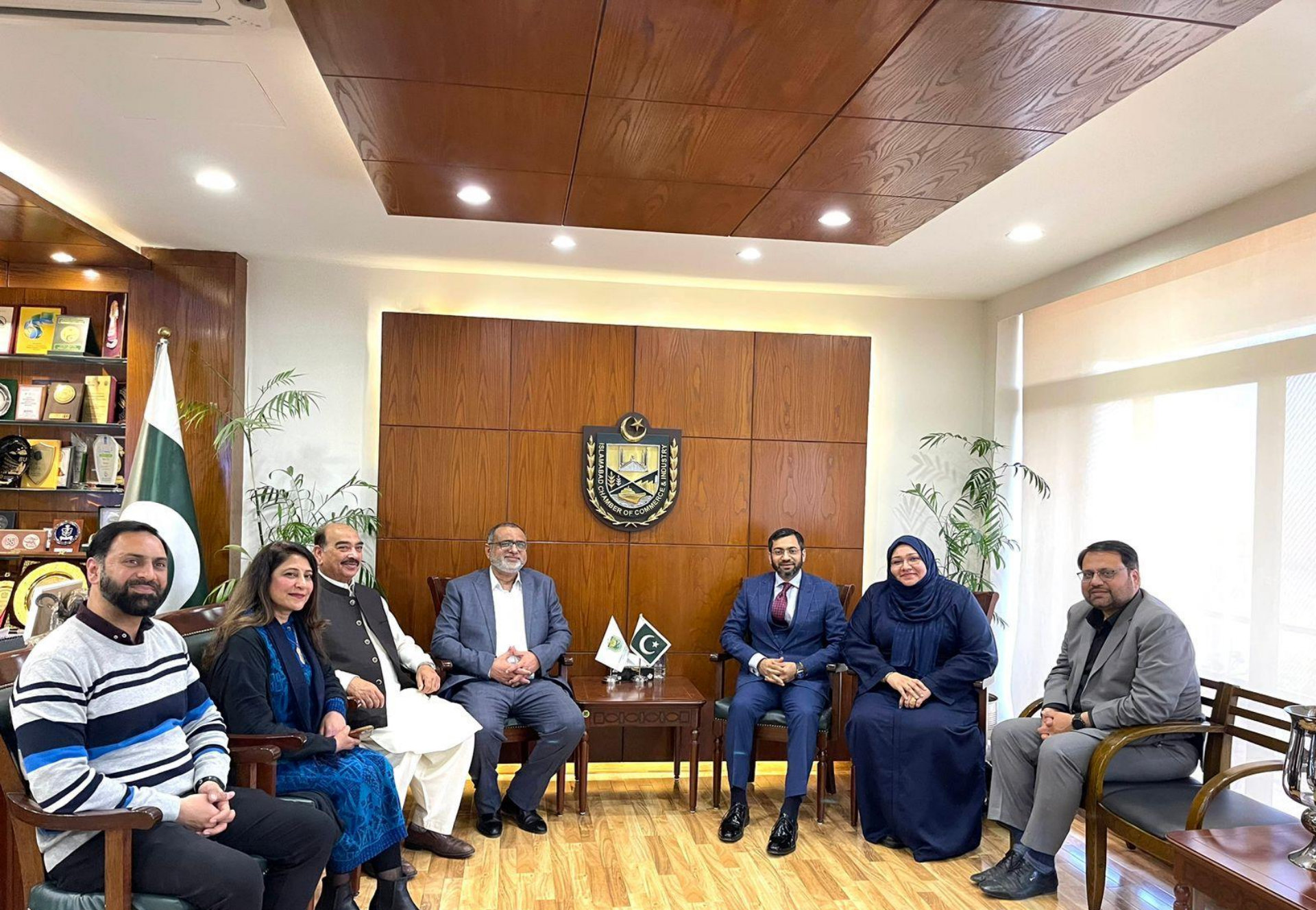
Meeting with VP of the Islamabad Chamber of Commerce (Feb 2024)