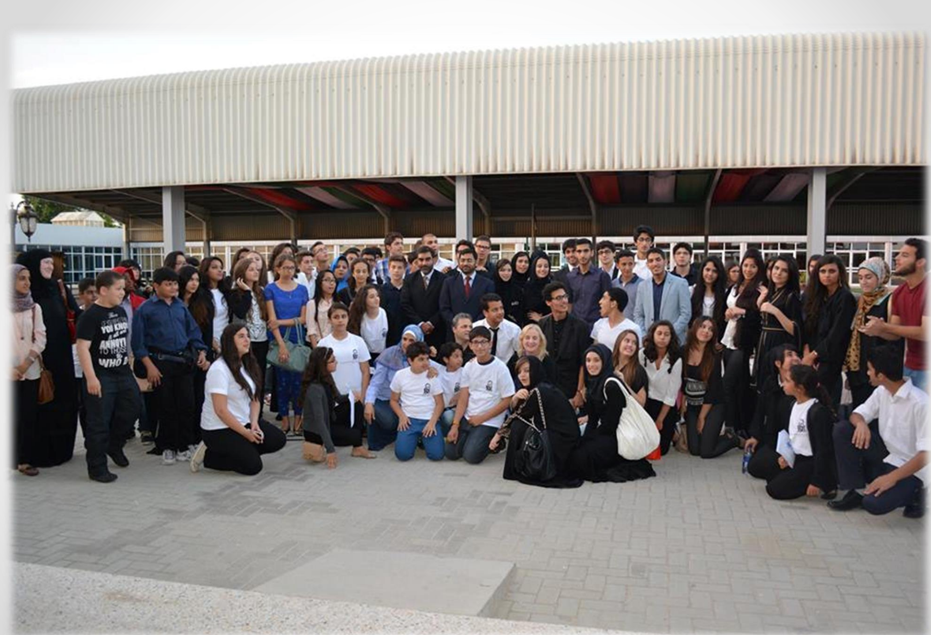
NDI Mass Mentoring Sessions (2014-21)