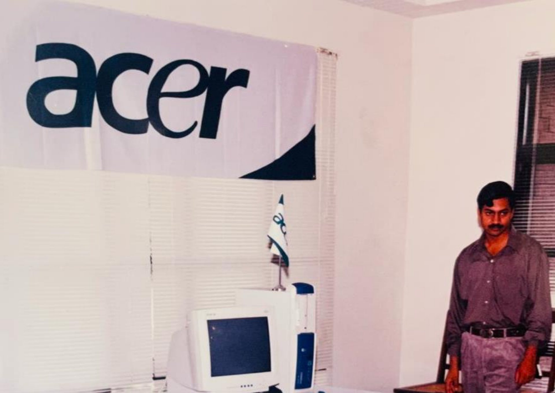
Early Career Enterprises (1996 - 1999)