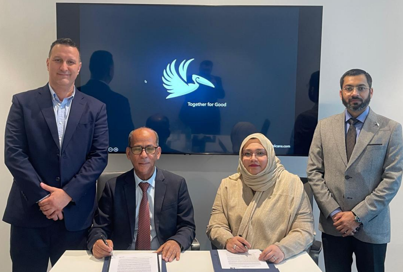
Signing Ceremony with Agriculture Bank Mauritania in Dubai (May 2025)