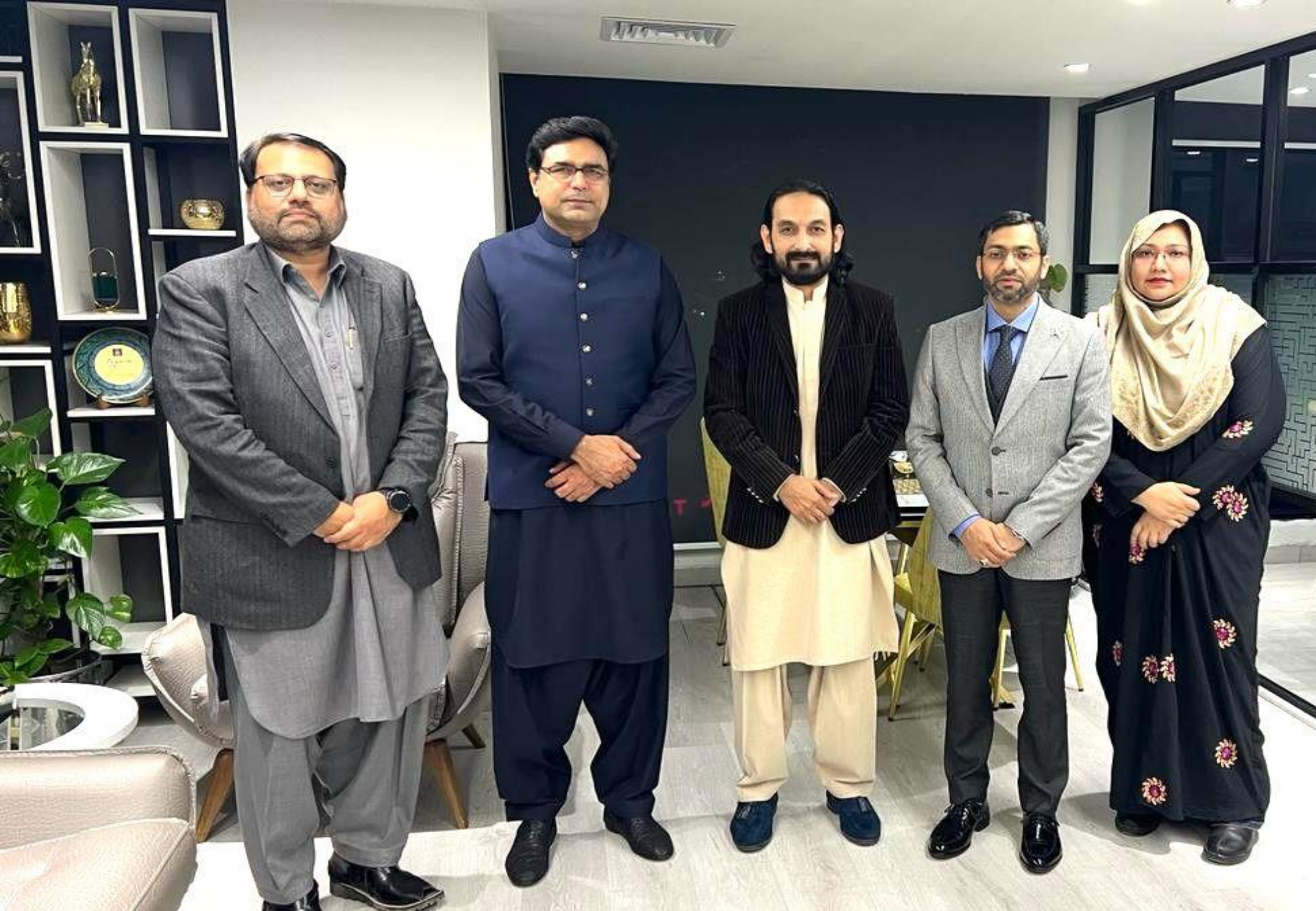
Focused Meeting on Real-Estate JV Developments in Muhafiz City HQ Islamabad (Feb 2024)