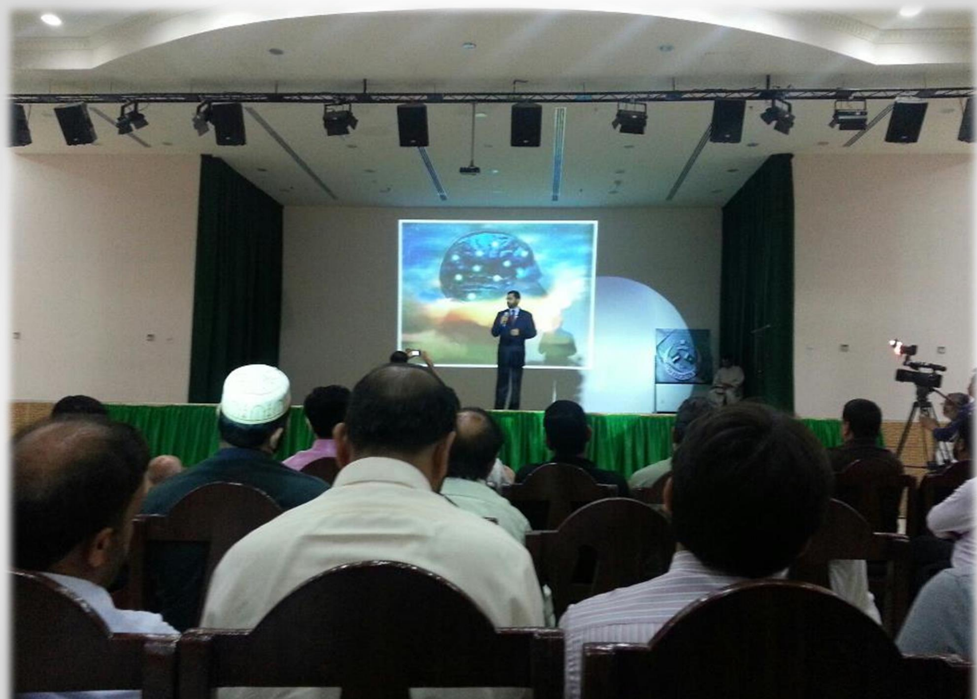
Public Lecture Series on “Depression, Stress and Anxiety” (2013)