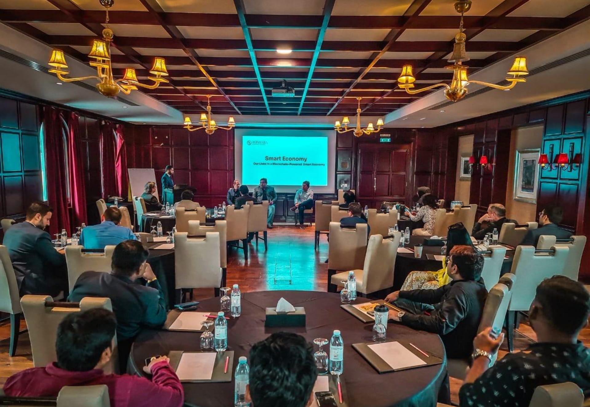
Pelicans Lounge Investment Meetings (2022-25)