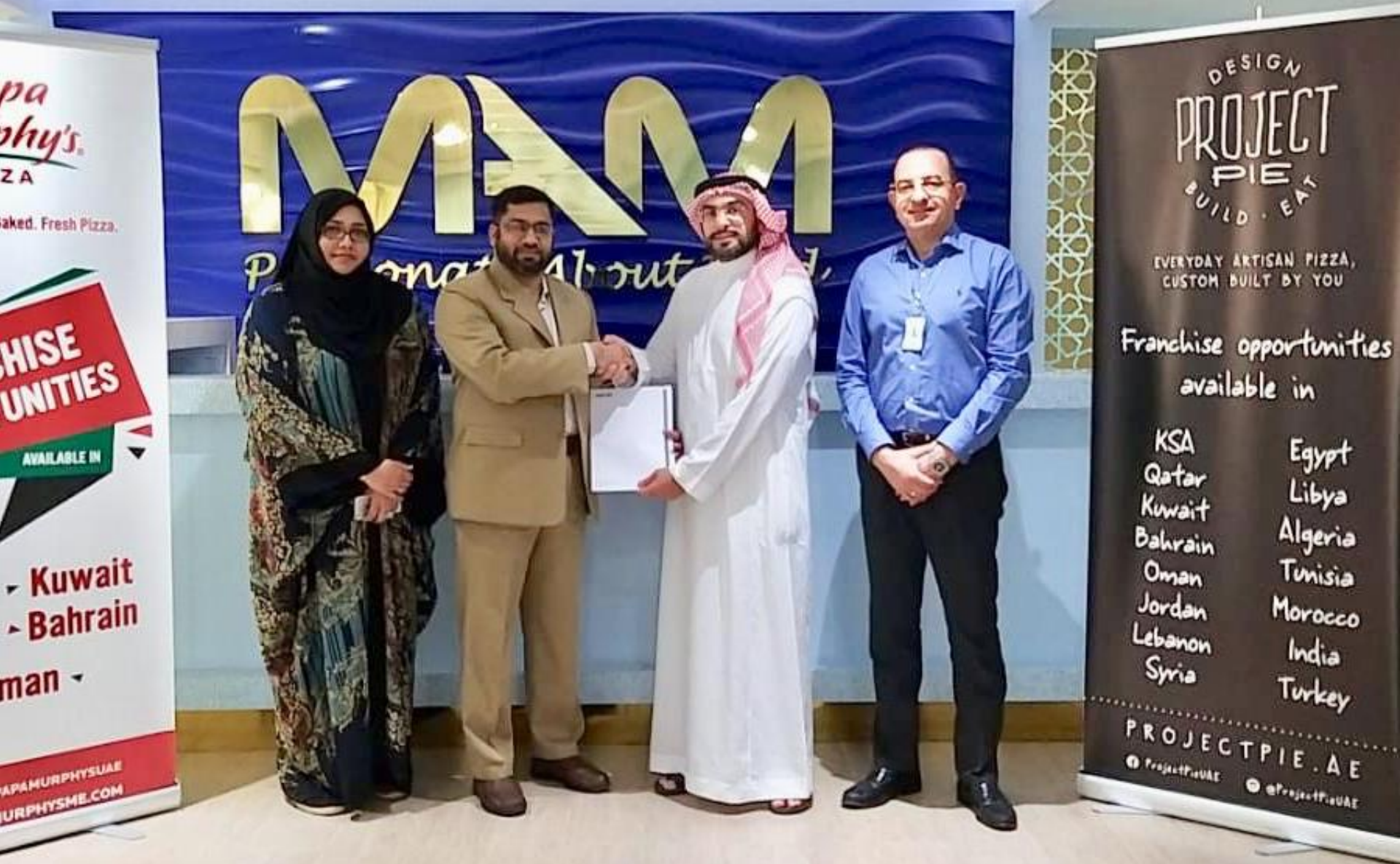
WePelicans Economic Advisory Services (2019-25)