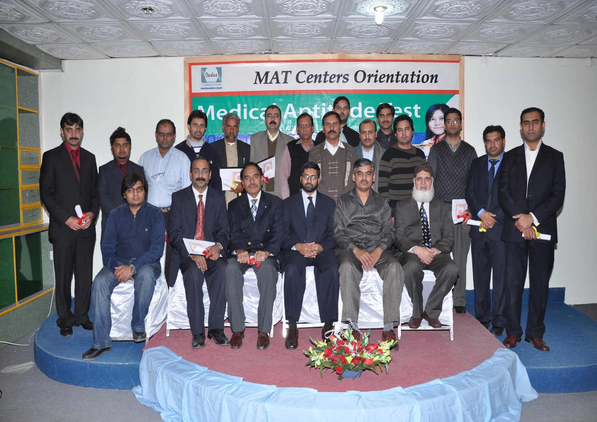
Introducing Neuroscience based (AIMS) Aptitude Inference Mapping System (2009-2012)